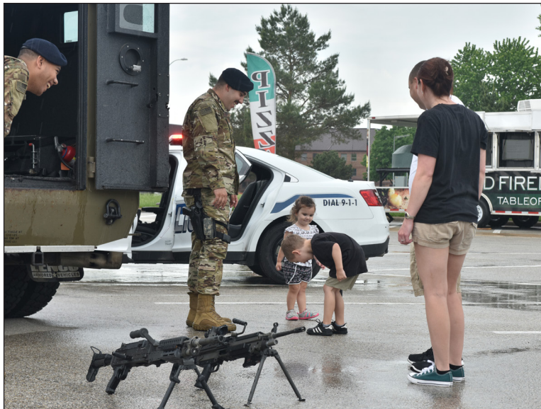
An Airman assigned to the 509th Security Forces Squadron, shows children how to collapse a baton May 16, 2018, at Whiteman Air Force Base, Mo. During Police Week, the 509th SFS displayed vehicles and equipment they use daily.