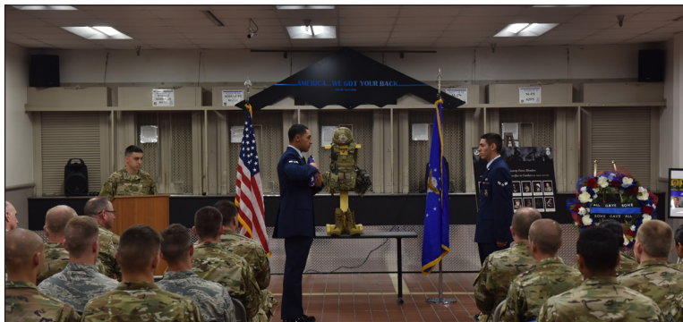
Members of Whiteman's Honor Guard perform a flag folding ceremony during the closing ceremony of National Police Week May 17, 2018, at Whiteman Air Force Base, Mo. The 509th Security Forces Squadron honored Airmen who have fallen in the line of duty.