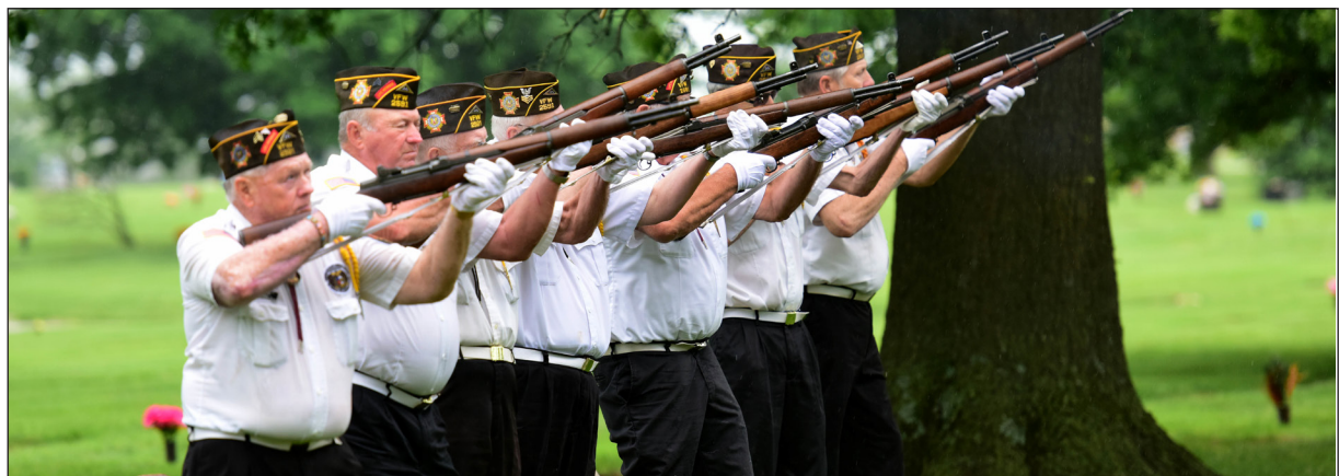
Members of the Sedalia Veterans of Foreign Wars Post No. 2591 fire gun volleys during the 30th Annual Whiteman Memorial Wreath Laying Ceremony at Memorial Park Cemetery in Sedalia, Mo., May 19, 2018.