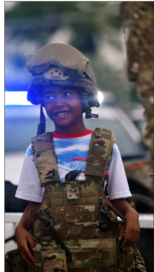
A child tries on the Security Forces Squadron's battle gear during National Police Week at Whiteman Air Force Base, Mo., May 16, 2018. Airmen from the SFS displayed equipment, gear and weapons that are used by Airmen.