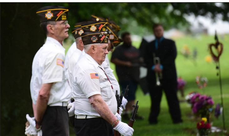
Members of the Sedalia Veterans of Foreign Wars Post No. 2591 stand in formation during the 30th Annual Whiteman Memorial Wreath Laying Ceremony at Memorial Park Cemetery in Sedalia, Mo., May 19, 2018.