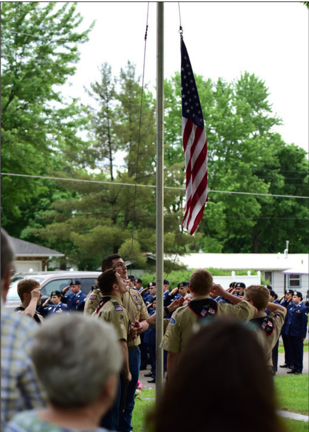
Boy Scout Troop 61 hoists the American Flag during the 30th Annual Whiteman Memorial Wreath Laying Ceremony at Memorial Park Cemetery in Sedalia, Mo., May 19, 2018.