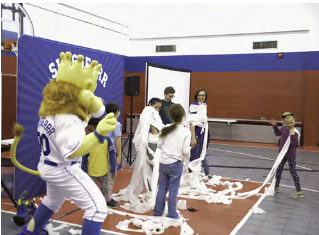
Children wrap each other in toilet paper during a team-building activity on Dec. 17, 2018, at Whiteman Air Force Base, Mo. Members of the Kansas City Royals baseball team came to the Whiteman Youth Center to lead an anti-bullying education event.