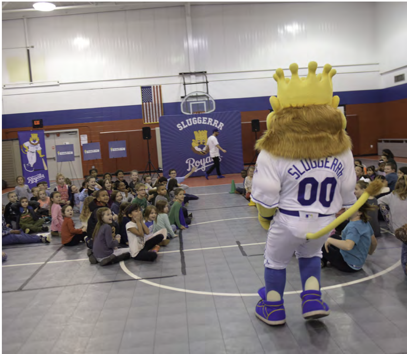
Members of the Kansas City Royals baseball team visit Whiteman Air Force Base, Mo. on Dec. 13, 2018. The team led an anti-bullying exercise for nearly 100 children at the Youth Center on base.