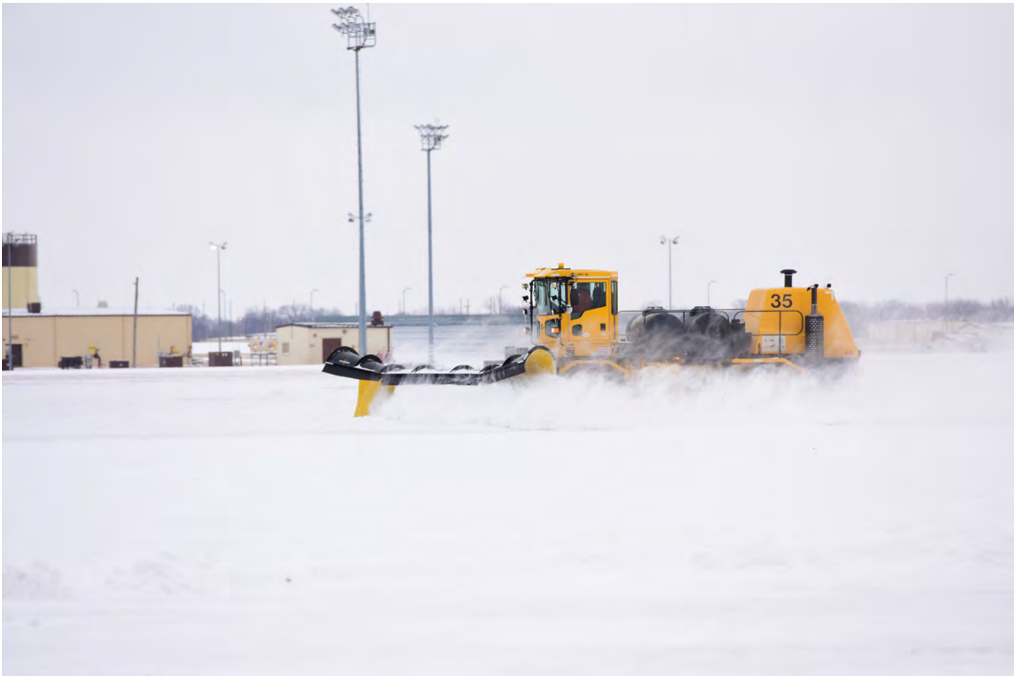
A plow moves snow during the 2017 winter season on Whiteman Air Force Base, Mo.