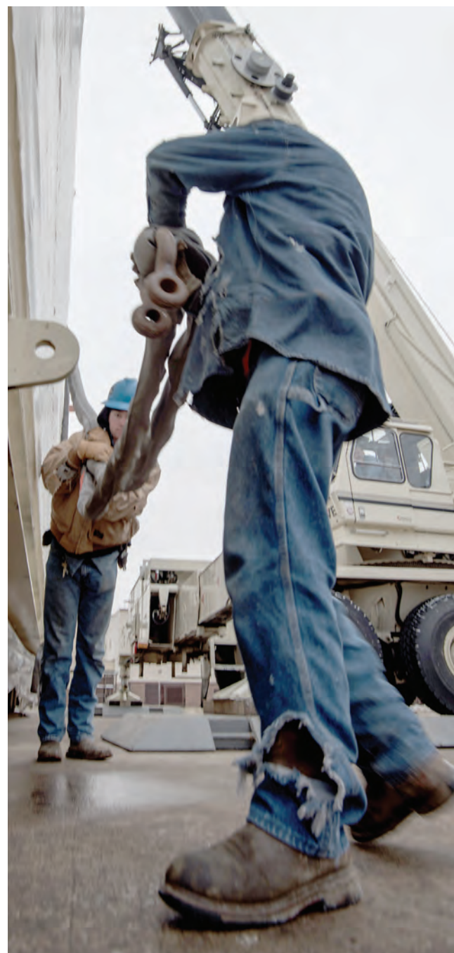
Contractors prepare the special access program facility (SAPF) to be moved onto the flight line Dec. 6, 2018, at Whiteman Air Force Base, Mo. The addition of the SAPF looks to save the 509th Maintenance Group roughly 30 man hours a week with its quicker processing capabilities and more centralized location on the flight line.

Consolidating all of these components into the new SAPF facility will save the 509th MXG roughly 30 man-hours a week and will assure that B-2 repairs are made swiftly and more accurately than ever before.