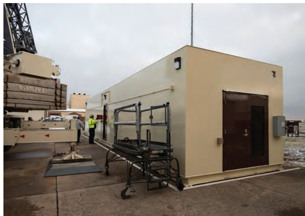
Contractors successfully deliver the new special access program facility (SAPF) Dec. 6, 2018, at Whiteman Air Force Base, Missouri. The SAPF allows the 509th Maintenance Group to detect defects in its radar cross section characteristics. Fixing these defects is essential to the B-2 Spirit Bomber's stealth abilities.