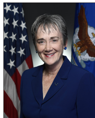
Heather Wilson Secretary of the Air Force