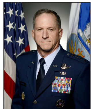
David L. Goldfein General, USAF Chief of Staff