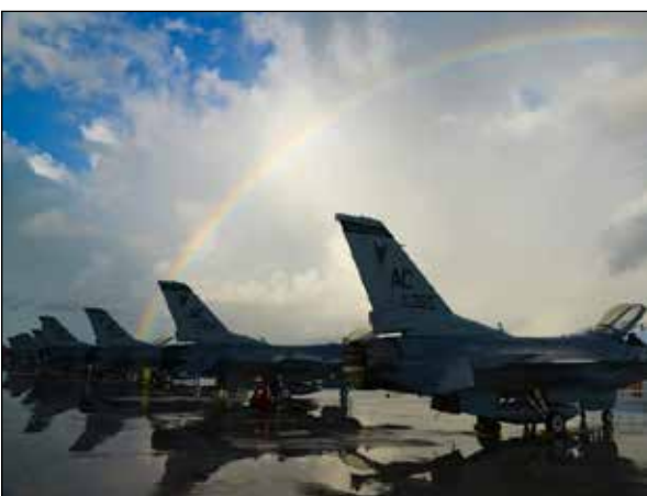
A rainbow appears over F-16 Fighting Falcons from the New Jersey Air National Guard's 177th Fighter Wing, on the flightline at Boca Chica Naval Air Station, Florida, Nov. 9, 2018. Maintenance, operations, logistics and security personnel from the wing traveled to the Key West Naval facility to take advantage of the weather and fly numerous training sorties and incentive flights.