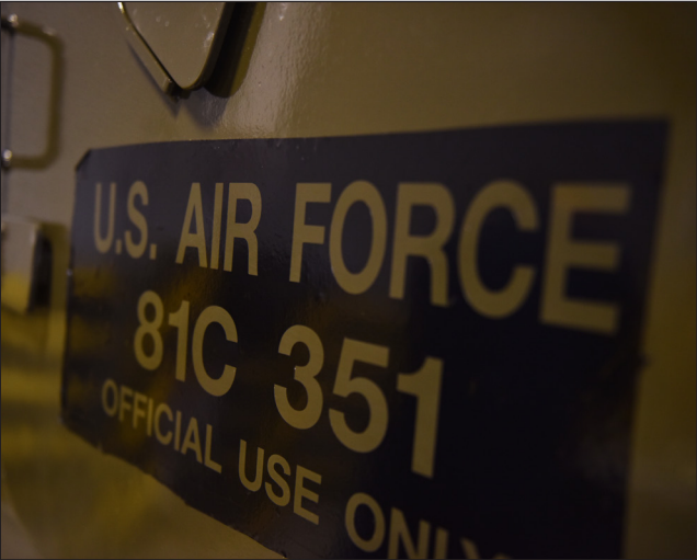
An adhesive U.S. Air Force decal is placed onto the doors of a Cadillac Gage Peacekeeper II at Whiteman Air Force Base, Mo., Dec. 11, 2017. The peacekeeper, once used in missile convoys in the 80's and early 90's, will be memorialized at the heritage park on base.