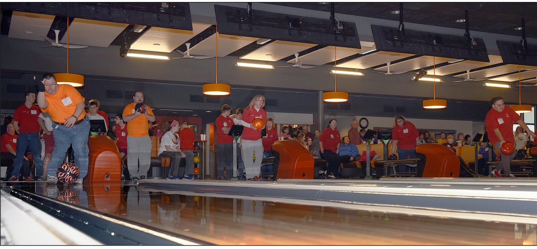
Athletes participate in the Missouri Special Olympics Bowling Tournament at Whiteman Air Force Base, Mo., Nov. 18, 2017. This year's Annual Special Olympics Bowling Tournament hosted 11 groups from around Missouri. Athletes typically train for at least eight weeks for the sports they choose to participate in. They can participate on a local level, followed by area, district and sometimes regional competition.