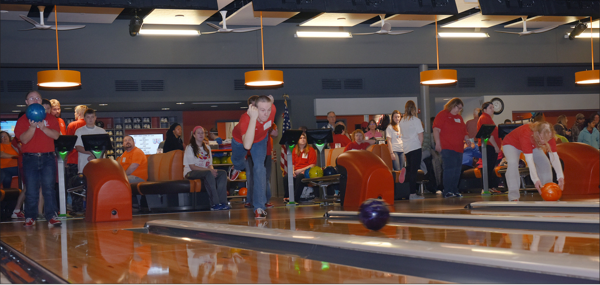
Athletes participate in the Missouri Special Olympics Bowling Tournament at Whiteman Air Force Base, Mo., Nov. 18, 2017. The Annual Special Olympics Bowling Tournament hosted 11 groups from around Missouri. Special Olympics Missouri offers year-round sports training and athletic competitions. More than 16,500 athletes participate in this program. Athletes typically train for at least eight weeks for the sports they choose to participate in. They can participate on a local level, followed by area, district and sometimes regional competitions. Special Olympics athletes are men, women, boys and girls who train and compete, learning to win and lose, and striving to do their best in their sport.