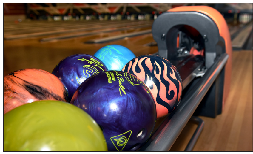
Lanes are prepared and bowling balls are placed on the machines before the Special Olympics Bowling Tournament at Whiteman Air Force Base, Mo., Nov. 18, 2017. The Annual Special Olympics Bowling Tournament hosted 11 groups. Special Olympics Missouri offers year-round sports training and athletic competitions. More than 16,500 athletes participate in this program.