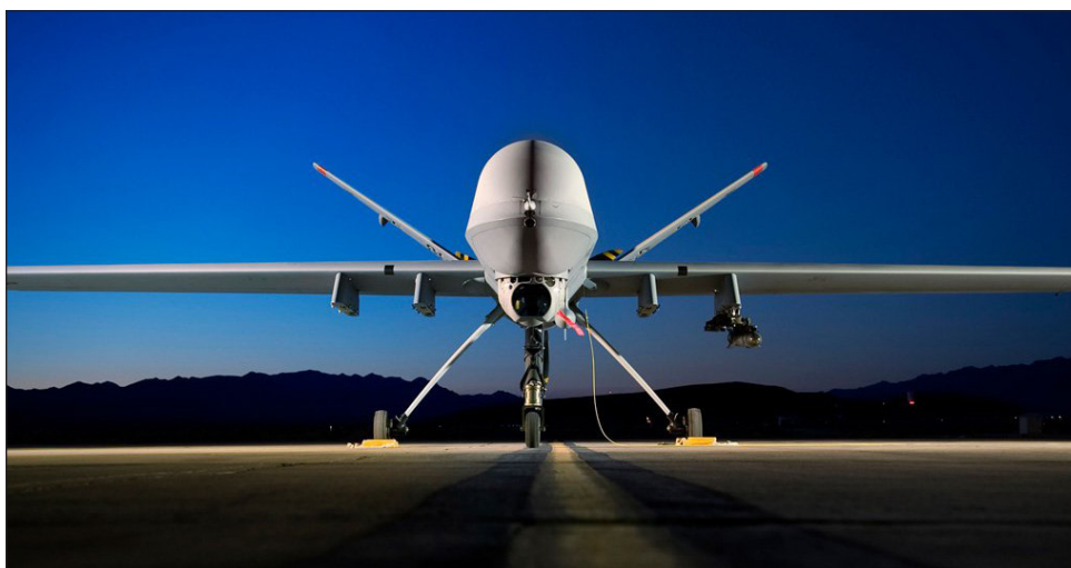
File photo The MQ-9 Reaper is a remotely piloted aircraft that is employed primarily against dynamic execution targets and secondarily as an intelligence collection asset. The MQ-9 carries a nearly 4,000-pound payload and has the ability to carry both missiles and bombs.

While the MQ-1 proved its weapons proficiency, it was never originally