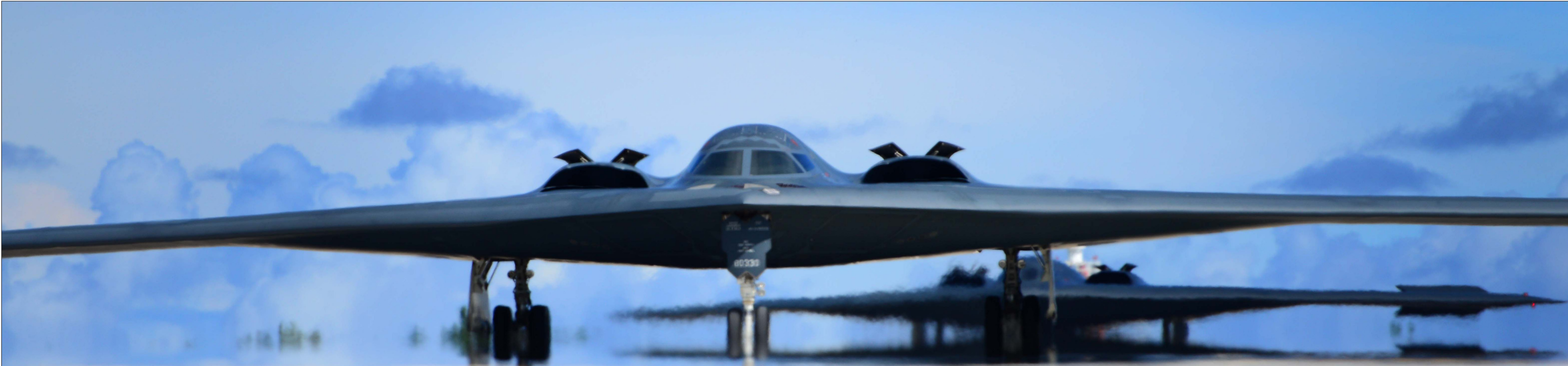
Two U.S. Air Force B-2 Spirit aircraft deployed from Whiteman Air Force Base, Mo., taxi back to the parkway after a local flying mission at Andersen Air Force Base, Guam, Jan. 16, 2017. Close to 200 Airmen and three B-2s deployed from Whiteman Air Force Base, Mo., and Barksdale Air Force Base, La., in support of U.S. Strategic Command Bomber Assurance and Deterrence missions. USSTRATCOM units regularly conduct training with and in support of the Geographic Combatant Commands. USSTRATCOM, through its global strike assets, helps maintain global stability and security while enabling units to become familiar with operations in different regions.