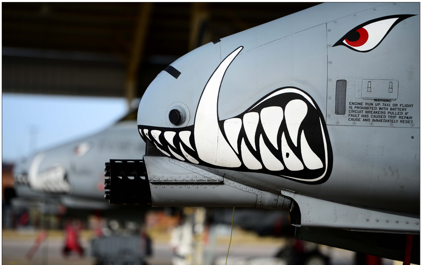
U.S. Air Force A-10 Thunderbolt II aircraft sit on the flightline at Whiteman Air Force Base, Mo., Feb. 14, 2017. The aircraft has excellent maneuverability at low air speeds and altitude, and is a highly accurate and survivable weapons-delivery platform. The aircraft can loiter near battle areas for extended periods of time and operate in low ceiling and visibility conditions.

The Thunderbolt II can be serviced and operated from austere bases with limited facilities near battle areas. Many of the