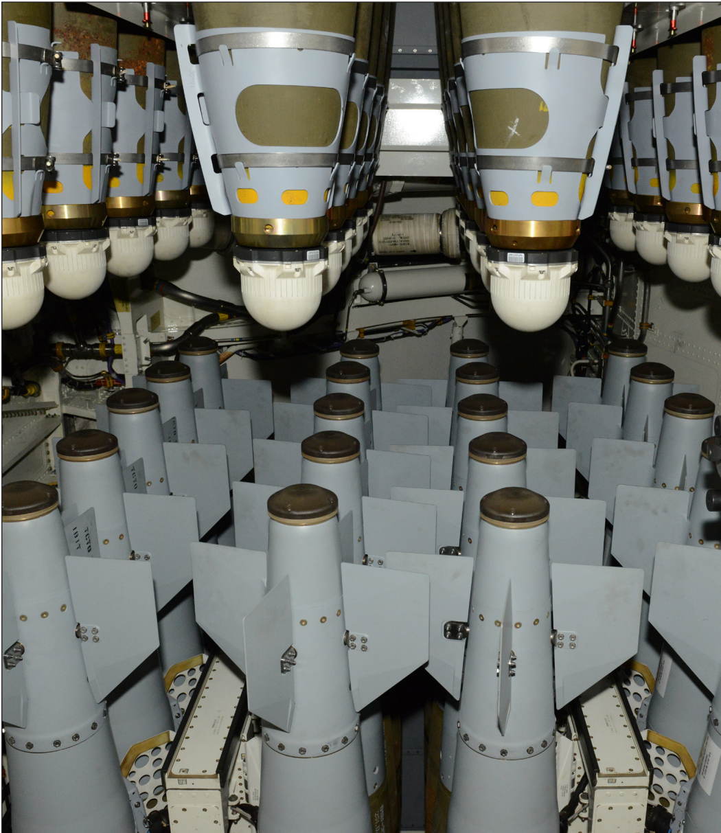
The B-2s that struck two ISIS training camps on Jan. 18, 2017, were each loaded with 80 GBU-38 Joint Direct Attack Munitions. The strikes were conducted in coordination with the Libyan Government of National Accord, authorized by the President of the United States, and validated our ability to strike targets across the globe anytime, anywhere.