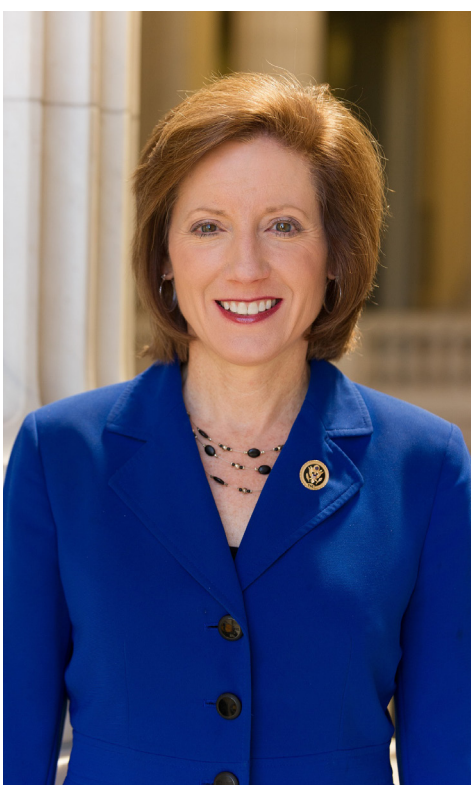
Missouri 4th Congressional District Representative Vicky Hartzler

The nation is indebted to each and every one of you. I have the opportunity to tell the Whiteman story to many people. It gives me great pride to describe how the Active Duty and Guard components come together to fulfill the wide spectrum of missions for the B-2. From taking the fight to ISIS to standing guard with our nation's arsenal, I could not be more proud. Likewise, the 442d's Active and Reserve components are second to none when it comes to employing the A-10 Thunderbolt II. Their fight against violent extremism in the Middle East remains central to our security at home, and I am eternally grateful. I am equally