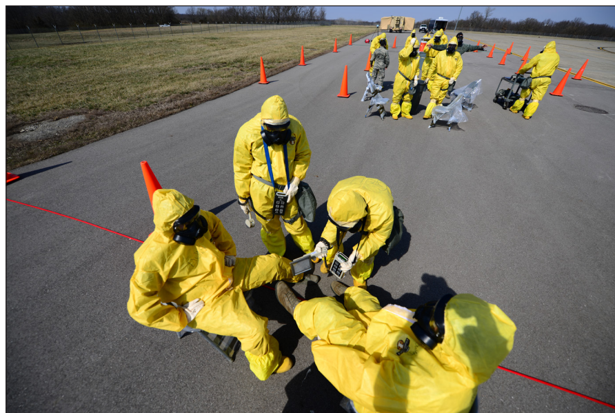
Airmen from the 509th Civil Engineer Squadron process through the contamination control station during the Initial Response Force/Response Task Force Field Training Exercise at Whiteman Air Force Base, Mo., March 15-16, 2017.