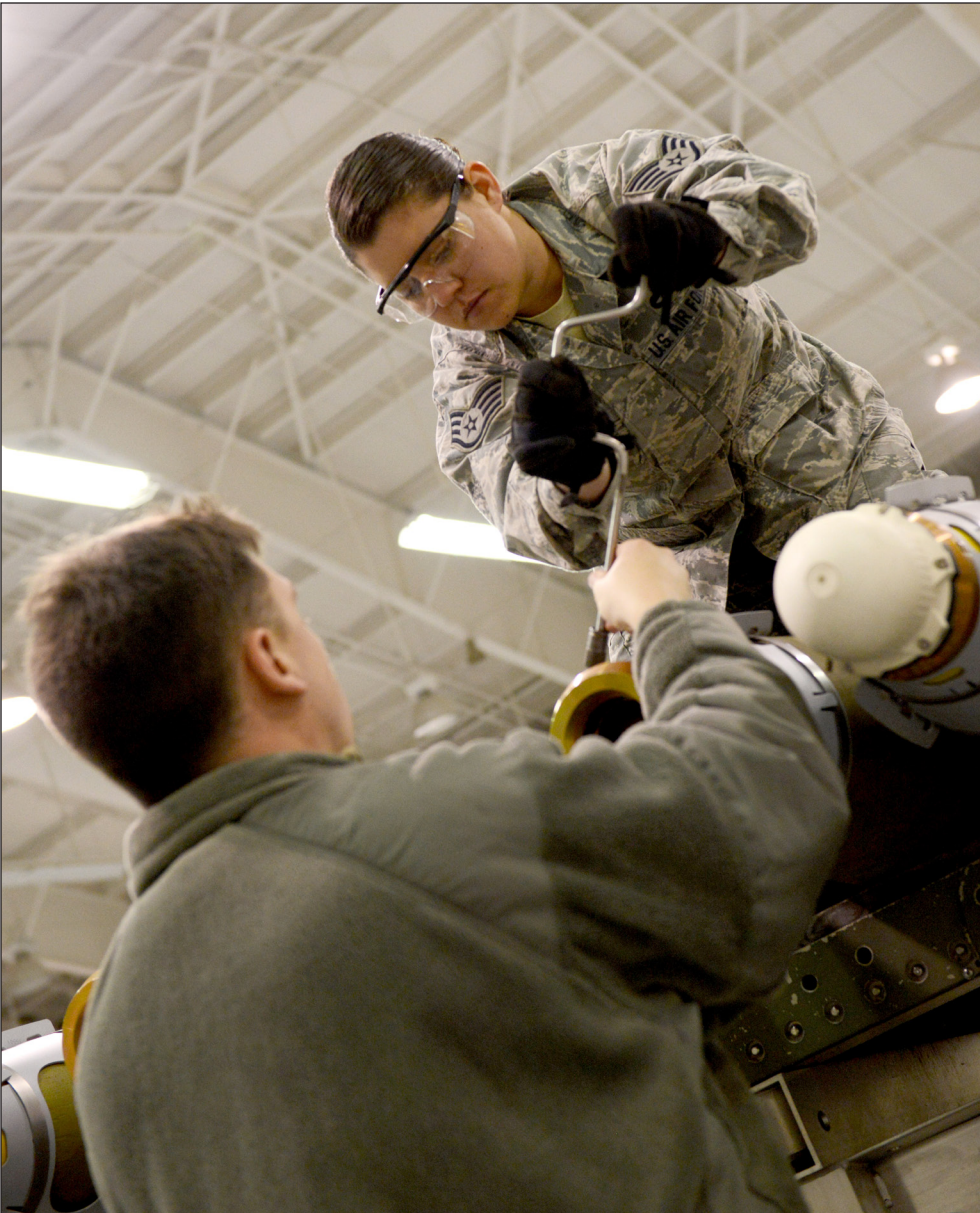
Whiteman's Total Force team executed precision strikes against two ISIS camps in Libya on Jan. 18, 2017. The strikes, which were completed by two B-2s over the course of a 30+ hour mission, were enabled by the dedication and professionalism of every Team Whiteman member.

Total Force Airmen ensure safe, secure and effective nuclear and conventional airpower each and every day at Whiteman Air Force Base, Missouri. Home to the B-2 Stealth Bomber – the world’s premier weapons system – Whiteman takes great pride in tackling the unique challenges associated with our vital mission. Specifically, our dedicated bomber Airmen are tasked by the President of the United States to execute strategic deterrence, global strike and combat support ... anytime, anywhere. To accomplish this mission, our Total Force team of bomber Airmen remain combat-ready, while continuously innovating for tomorrow’s fight.