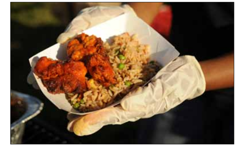
A 131st Medical Group member holds up a half order of buffalo and honey barbecue chicken wings with fried rice served at their tent during the Independence Day Celebration at Whiteman Air Force Base, Mo., June 30, 2016. The food and drinks were part of the celebration held at Ike Skelton Lake for Whiteman personnel and their families.