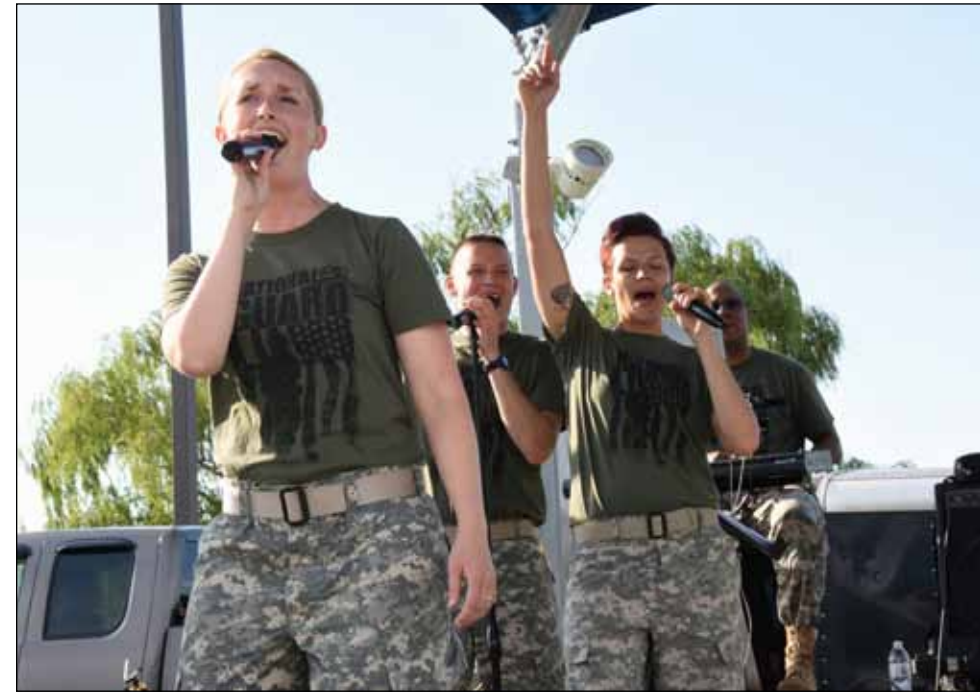
Members of the Missouri National Guard's 135th Army Band perform at the Independence Day Celebration at Whiteman Air Force Base, Mo., June 30, 2016. The 135th Army Band's rock element, Fire for Effect, and the country element, Show Me Country, teamed up as a "super group" and performed a wide offering from various artists and eras of music.