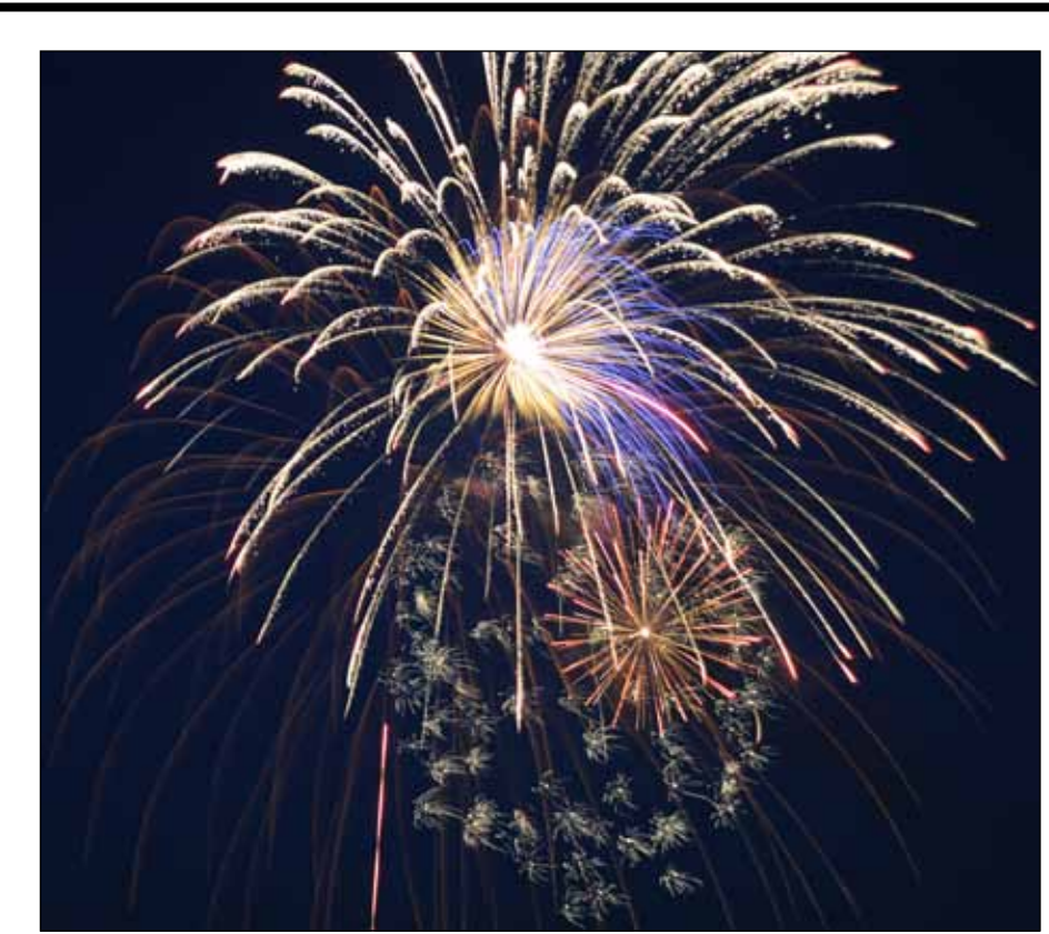
LEFT: Fireworks light the night sky during the Independence Day Celebration at Whiteman Air Force Base, Mo., June 30, 2016. This was the first year the show used 8-inch shells, versus the usual 6-inch shells, for a bigger display for Whiteman personnel and their families.

RIGHT: A participant of the Independence Day Celebration throws a ball toward the dunk tank button at Whiteman Air Force Base, Mo., June 30, 2016. Personnel and their families had the opportunity to send their squadrons' first sergeants into the tank of cold water.