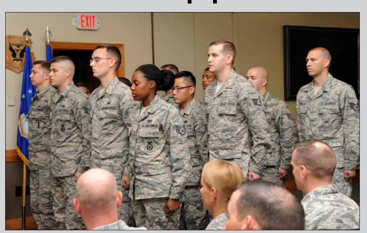
and accept the noncommissioned officer's charge at

U.S. Air Force staff sergeant promotees acknowledge and accept the noncommissioned officer's charge at Whiteman Air Force Base, Mo., June 30, 2016. Whiteman's newest NCOs received their certificate of induction at the promotion ceremony.