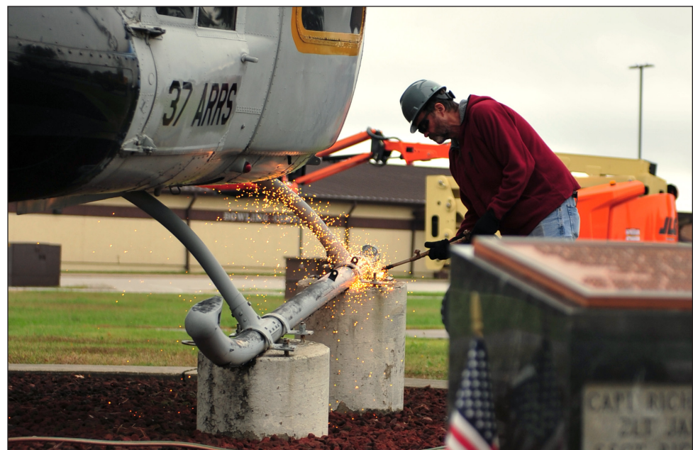
ABOVE: A member of Team Whiteman torches the bolts of a harness holding in place a memorial aircraft at Whiteman Air Force Base, Mo., Oct. 12, 2016. The memorial was placed as a reminder to service members of the ultimate sacrifice Airmen make for peace and freedom.