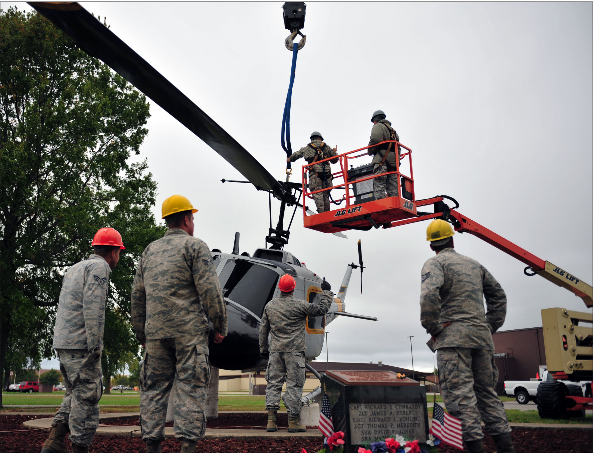
Members of the 509th Civil Engineer Squadron attach a crane harness to a memorial aircraft at Whiteman Air Force Base, Mo., Oct. 12, 2016. Two pilots and four enlisted Airmen perished while performing missile convoy duties, prompting this memorial. The aircraft will be refurbished and then relocated near Oscar-1.