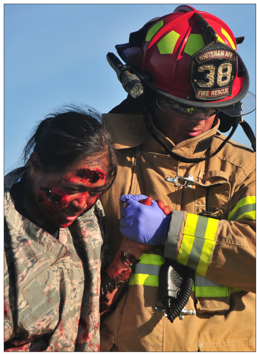
A firefighter from the 509th Civil Engineer Squadron escorts a simulated wounded Airman from a simulated crash site during a major accident response exercise (MARE)at Whiteman Air Force Base, Mo., June 8, 2016. During a MARE all simulated medical injuries and victims are treated as real by firefighters and medical Airmen adding the importance of urgency to the training.