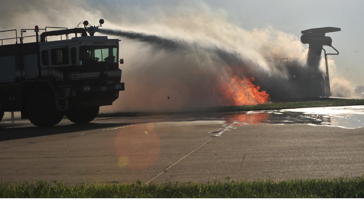
Firefighters from the 509th Civil Engineer Squadron move their fire engine into position to extinguish a simulated aircraft fire during a major accident response exercise (MARE) at Whiteman Air Force Base, Mo., June 8, 2016. Firefighters and other emergency response personnel conducted the MARE to prepare for any mishaps that may occur in real-world situations.