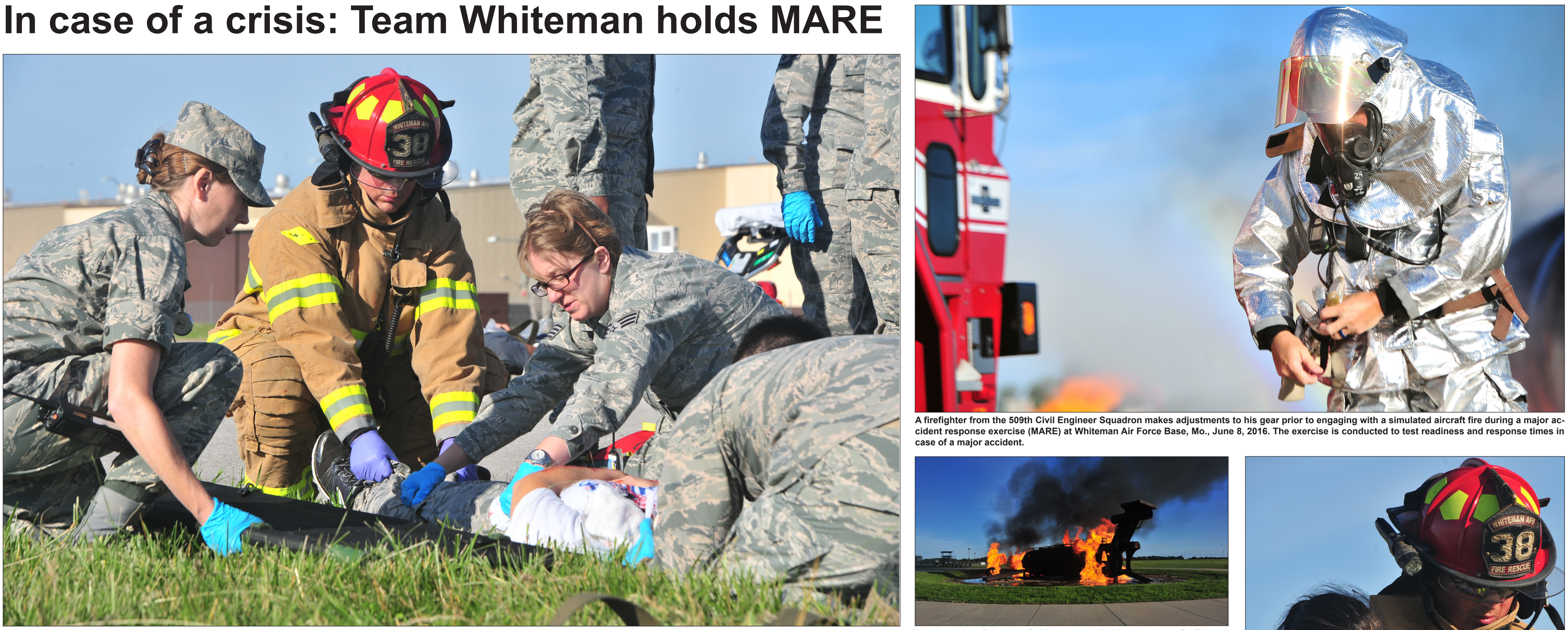
Members of Team Whiteman work together to aid a simulated aircraft accident victim during a major accident response exercise (MARE), at Whiteman Air Force Base, Mo., June 8, 2016. During a MARE all simulated medical injuries and victims are treated as real by firefighters and medical Airmen adding the importance of urgency to the training.