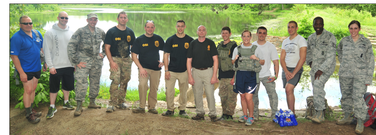
Members of Team Whiteman gather for a group photo after completing a 2-mile Police Week ruck at Knob Noster State Park, Knob Noster, Mo., May 18, 2016. The 2-mile ruck race was a part of a competition spanning the course of three days.