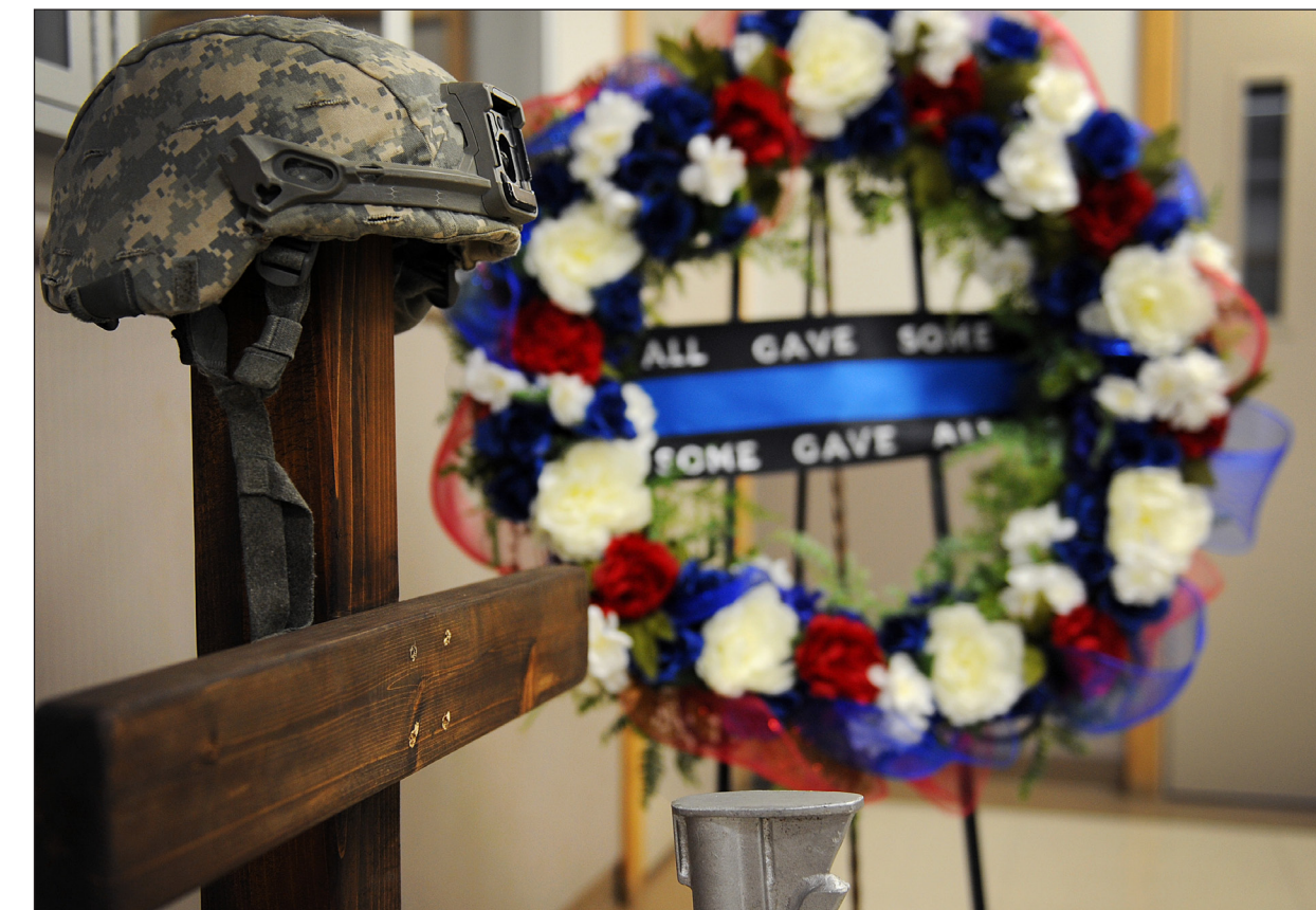
A battlefield cross is displayed in the 509th Security Forces Squadron building for National Police Week at Whiteman Air Force Base, Mo., May 16, 2016. Whiteman honored National Police Week, May 16-20, with events such as a vigil for fallen law-enforcement officers, a memorial 5K run and a base-wide tournament including golf, bowling, softball and other games.