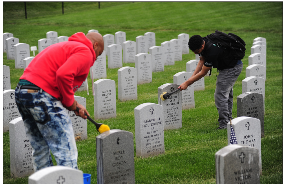
Participants in Motorcycle Safety Day clean headstones at the Missouri Veterans Cemetery in Higginsville, Mo., April 25, 2016. As part of Motorcycle Safety Day, volunteers join together in a mentorship ride to the cemetery to help clean the cemetery grounds.