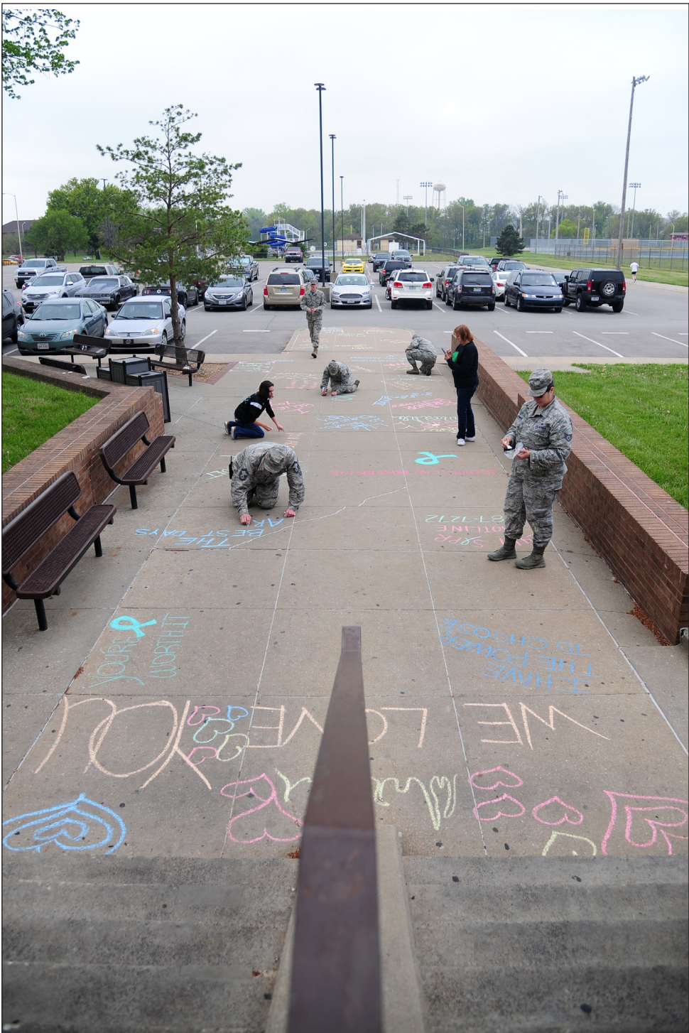
Sexual Assault Prevention and Response team victim's advocates use chalk to write inspirational messages in front of the fitness center at Whiteman Air Force Base, Mo., April 22, 2016. The messages were written to support survivors of sexual assault in recognition of Sexual Assault Awareness Month.