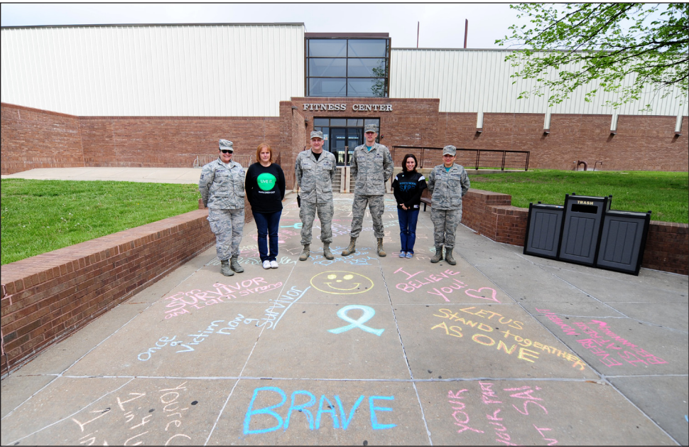
Sexual Assault Prevention and Response team victim's advocates pose in front of inspiring messages written in chalk at Whiteman Air Force Base, Mo., April 22, 2016. The messages were written in solidarity for survivors of sexual assault.