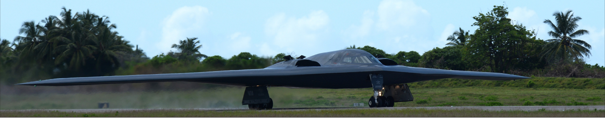
A B-2 Spirit from Whiteman Air Force Base, Mo., lands at an undisclosed location in the U.S. Pacific Command area of operations March 9, 2016. While in the Indo-Asia-Pacific, the B-2s will integrate and conduct training with ally and partner air forces and conduct a radio communications check with a U.S. air operations center.