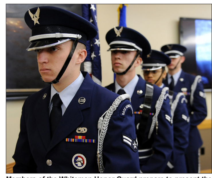
Members of the Whiteman Honor Guard prepare to present the colors at the National Prayer Breakfast at Whiteman Air Force Base, Mo., March 11, 2016. Every year, the National Prayer Breakfast has a different theme. This year's theme was "Your life matters and could change the course of history."