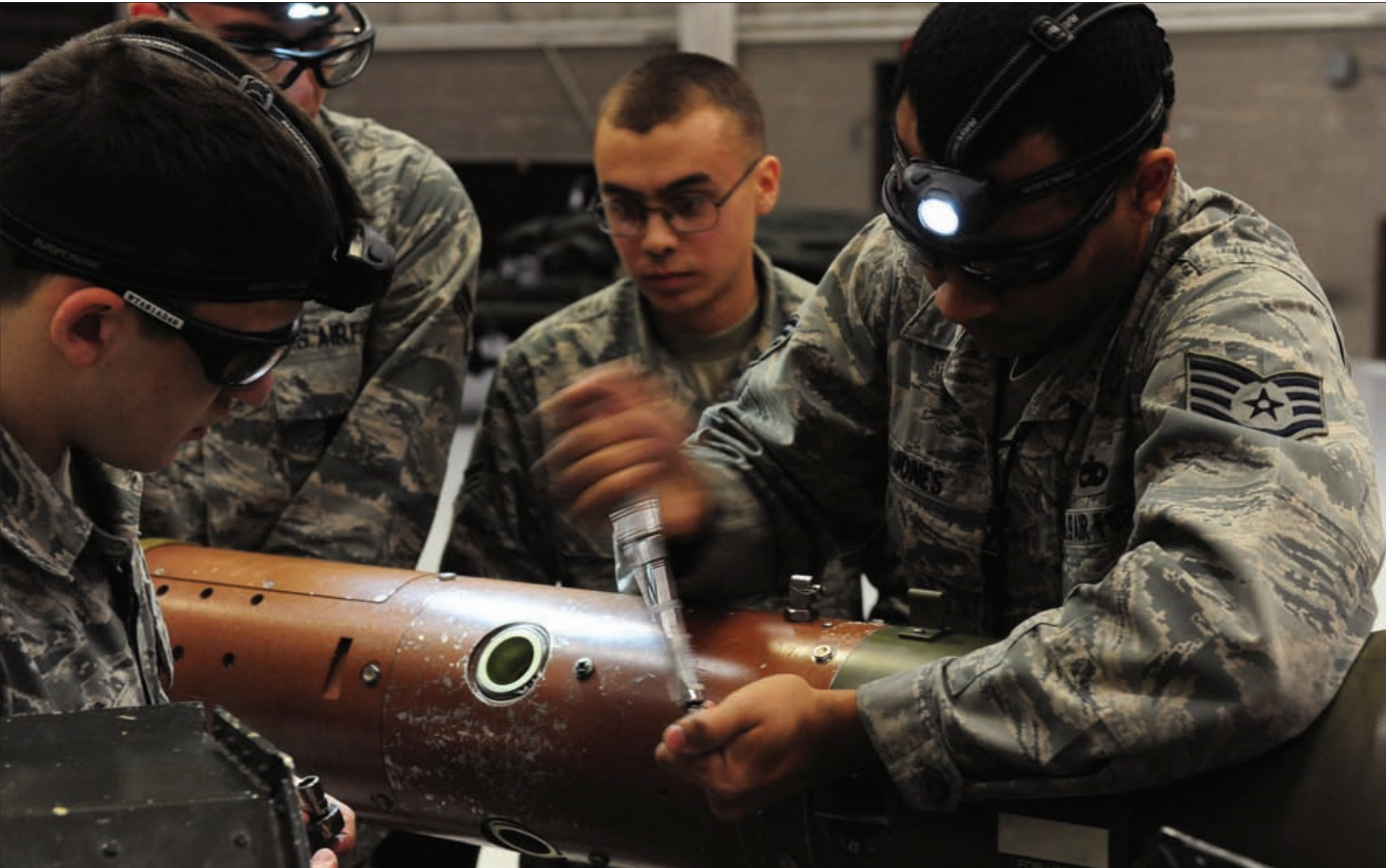
Load crew members from the 13th Aircraft Maintenance Unit tighten a bolt before transporting a GBU-28 B/B into a B-2 Spirit weapons load trainer during a quarterly weapons load competition at Whiteman Air Force Base, Mo., Jan. 13, 2016. Load competitions are held quarterly to test the crew's ability to load weapons in a timely and precise manner.