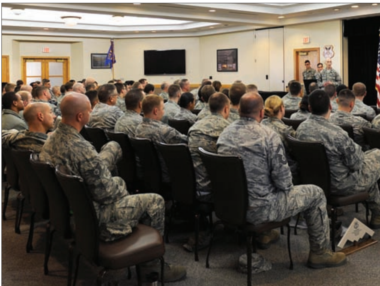
Members from the 509th Maintenance Group (MXG) participate in the MXG Annual Awards Ceremony at Whiteman Air Force Base, Mo., Jan. 14, 2015. Nominees competed in various categories such as Company Grade Officer (CGO) of the Year and Supervisor of the Year.