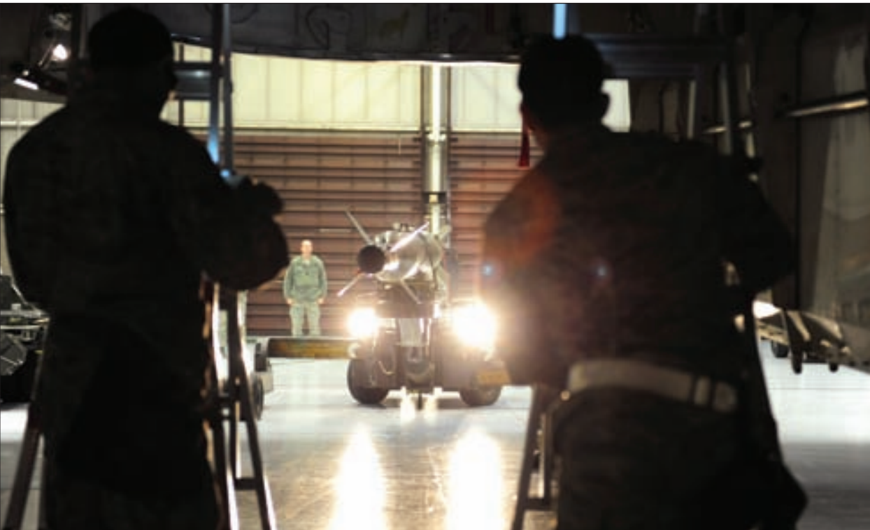
Load crew members from the 13th Aircraft Maintenance Unit wait as a GBU-28 B/B is transported on a jammer during a quarterly weapons load competition at Whiteman Air Force Base, Mo., Jan. 13, 2016. Each member of a weapons load crew has a set of specific tasks during loading operations.