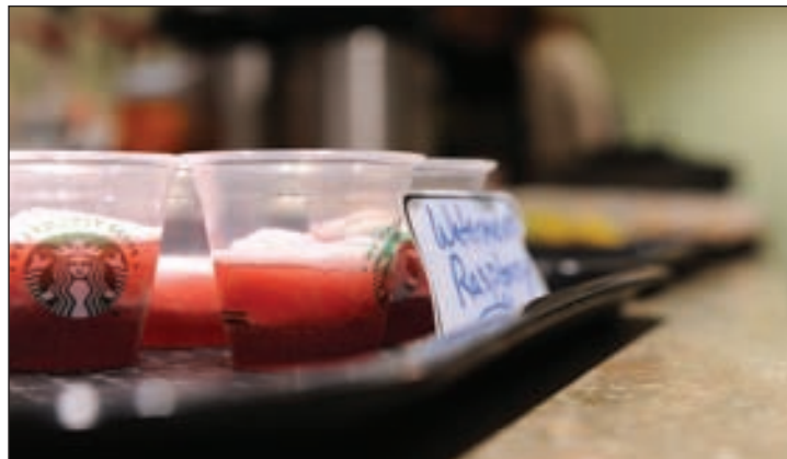
Smoothie samples are displayed at the Taste of 2016 Open House at Whiteman Air Force Base, Mo., Jan. 15, 2016. Members of Team Whiteman enjoyed an array of free food, games and prizes provided by the club to raise awareness of the benefits of being a club member.