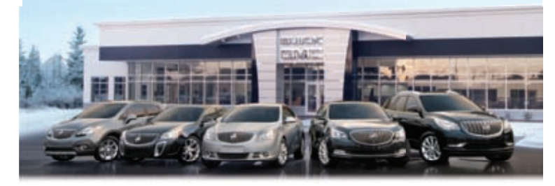
CELEBRATE THE HOLIDAYS WITH EXCEPTIONAL OFFERS ON ALL BUICK VEHICLES