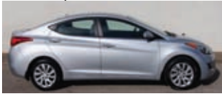
2011 Hyundai ELANTRA GLS

4DR auto a/c all power options w/ only 40k miles like new.