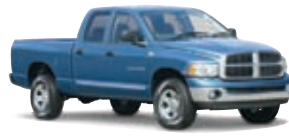
2004 Dodge RAM 1500 QUAD CAB

4x4, 5.7 Hemi w/ Hemi sport pkg., black w/ all power options 96k miles.. very clean