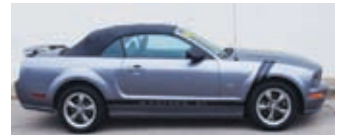
2006 Ford MUSTANG GT CONVERTIBLE

4.6 V6 auto, leather, all power option w/ only 90k miles WON'T LAST!