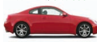
2004 Infiniti G-35 COUPE

3.5 V6 LEATHER.. all power options must see this unit.. 79k miles.. Very clean