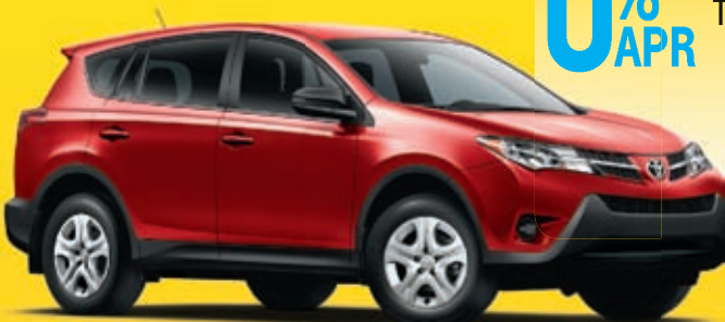
NEW 2013 TOYOTA RAV4

0% APR UP TO 60 MOS + $500 BONUS CASH OR LEASE $199 PER MO.