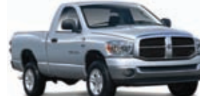
2007 Dodge RAM 1500 REG CAB

3.7 V6 ST Model w/ only 11k miles.. WOW.. This truck is like new.. Auto a/c very clean.