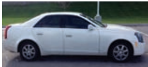
2005 Cadillac CTS 3.6 V6

4DR w/ only 44k miles..WOW.. pearl white w/ tan leather loaded!! MUST SEE!!