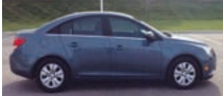
2012 Chevy CRUZE LS

4DR w/ only 13k miles..like new LS modle all power options