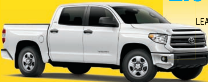
NEW 2014 TOYOTA TUNDRA

2.9% APR UP TO 72 MOS OR LEASE $299 PER MO.