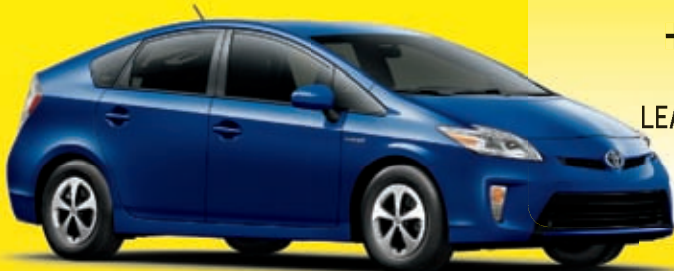
NEW 2013 TOYOTA PRIUS TWO

0% APR UP TO 60 MOS + $500 BONUS CASH OR LEASE $199 PER MO.