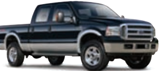
2006 Ford F-250 CREW CAB

4x4, 6.0 dsl, auto Harley Davidson pkg, black w/ black leather, all pwr. options, very rear truck w/ only 80k miles