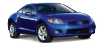
2006 Mitsubishi ECLIPSE GS COUPE

Auto all power options w/ only 70k miles.. very clean.