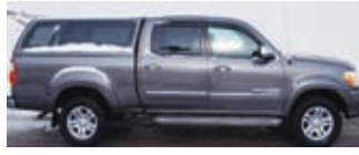
2006 Toyota TUNDRA DOUBLE CAB

4x4 SR5 V8, FULLY LOADED w/ only 67k miles.. very hard truck to find