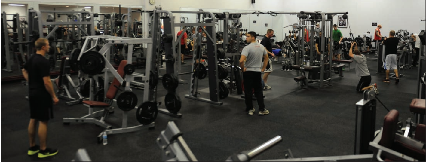
The base Fitness Center offers a full exercise room. Along with the exercise room, the Fitness Center has two basketball courts and a cardio room.