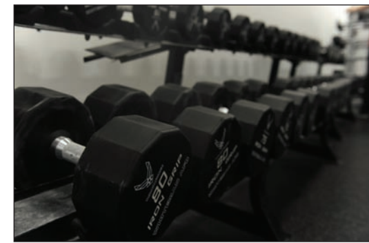
The base Fitness Center offers a wide variety of exercise machines and weights. The Fitness Center is open Mon. through Thurs. 5 a.m. till 1 a.m., Fri. 5 a.m. till 9 p.m., and Sat and Sun, 8 a.m. till 6 p.m.