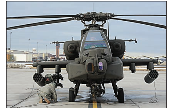
U.S. Army armament technicians from the 1-135th Attack Reconnaissance Battalion perform a daily inspection on an AH-64D Apache Longbow, Jan. 16. The Apache is a fourblade, twin-engine attack helicopter with a tail wheel-type landing gear arrangement and a twoperson cockpit.