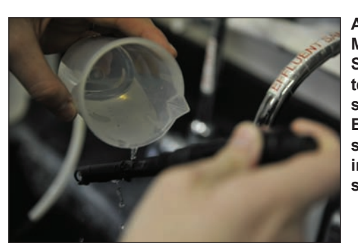
Airman 1st Class Stacey Moore,509th Civil Engineer Squadron Water and Fuels System Journeyman, rinses the pH stick with a water sample, Jan.15. By rinsing the pH stick with the same water sample, the pH reading will be as accurate as possible.