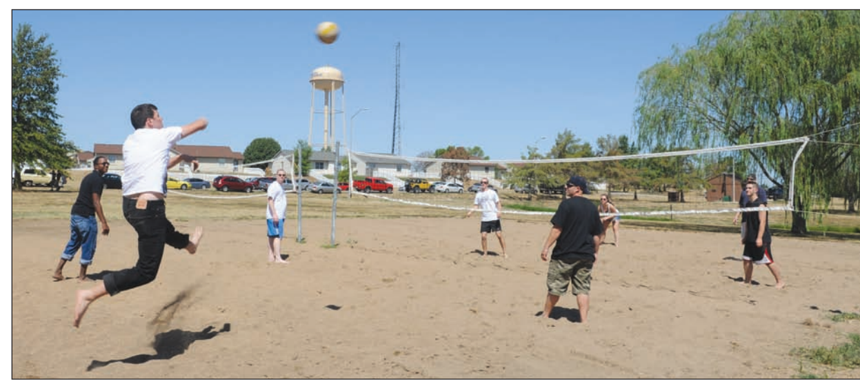
Whiteman members participate in a game of volleyball at the Atomic Luau, Aug. 17. There were games, food, and entertainment offered throughout the event.