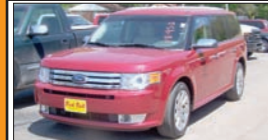
2011 FORD FLEX LIMITED AWD