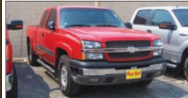
2003 CHEVROLET SILVERADO