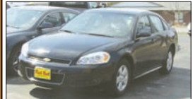
2010 CHEVROLET IMPALA LT

Power Windows, Locks, Cruise, Very Sharp #P199