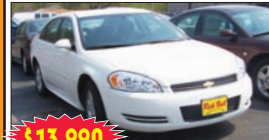
2009 CHEVROLET IMPALA LT