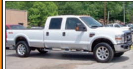
2008 FORD F350 LARIAT

Power Stroke, Lariat, Moonroof, 98K Miles #2266A