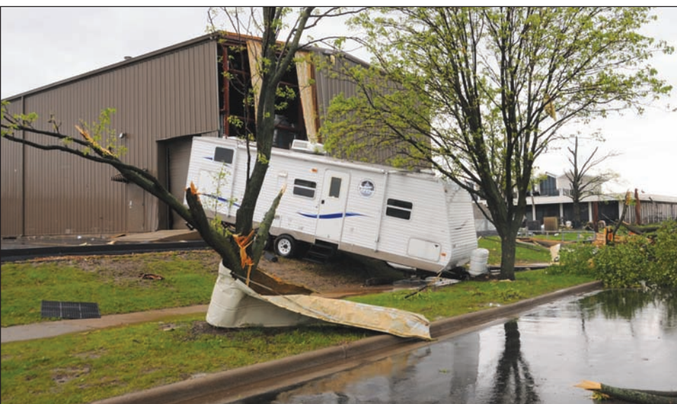
SAINT LOUIS -- An Air Force Emergency Management trailer owned by the 131st Bomb Wing, Lambert Air National Guard Base, Mo., rests against a tree after a Category EF4 tornado hit April 22.