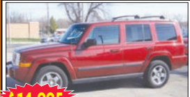
2007 JEEP COMMANDER