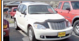
2007 CHRYSLER PT CRUISER

Low Miles, Local Trade, Must See, #1355ZA1