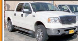
2007 FORD F150

4x4, Local Trade, 48K Miles, Nav., Moonroof, #2142A