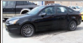
2010 FORD FOCUS SES