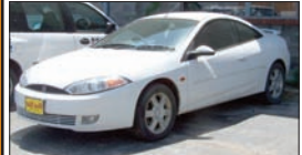
2002 MERCURY COUGAR V6

Spoiler, Alloy Wheels, Power Windows, Locks, #2209A