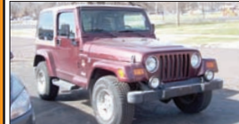
2002 JEEP WRANGLER

Local Trade, Hard/Soft Top, Sharp, #2172A1