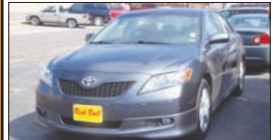
2007 TOYOTA CAMRY CE/L