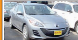
2010 MAZDA 3