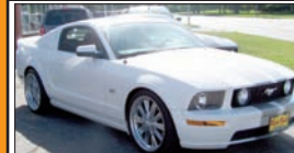
2005 FORD MUSTANG GT

Foose Wheels, Shaker 1000 Stereo, Leather, #3003A