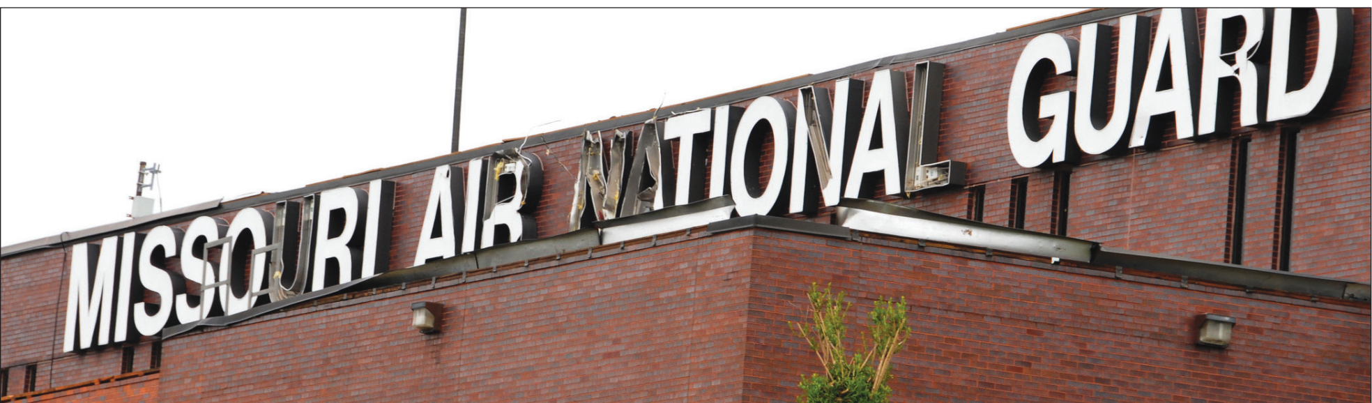
SAINT LOUIS -- A category EF4 tornado hit the Lambert Air National Guard Base, Mo., and damaged the previous 131st Bomb Wing headquarters building April 22. No injuries were reported to ANG personnel, but there was widespread damage across the south side of the base.