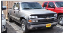
2001 CHEVROLET SILVERADO