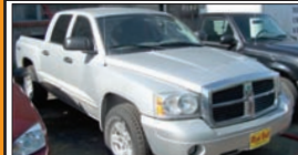
2005 DODGE DAKOTA SLT

Foose Wheels, Shaker 1000 Stereo, Leather, #3003A