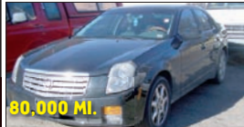
2003 CADILLAC CTS