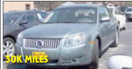
2008 MERCURY SABLE

Power Windows, Locks, Cruise, Very Sharp #P199