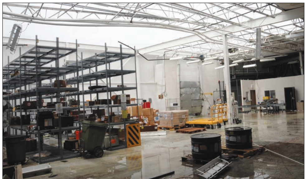
SAINT LOUIS -- A category EF4 tornado caused building damage at Lambert Air National Guard Base, Mo., April 22. No injuries were reported to ANG personnel, but there was widespread damage across the south side of the base.