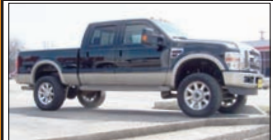
2010 FORD F250 DIESEL KING RANCH