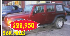
2007 JEEP WRANGLER