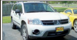
2006 MITSUBISHI ENDEAVOR

Alloy Wheels, AWD, Power Windows & Locks, #2249