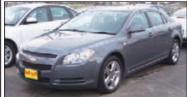
2008 CHEVROLET MALIBU LT