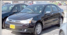
2011 FORD FOCUS SEL