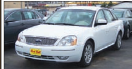
2007 FORD 500 SEL