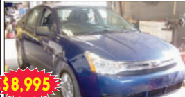
2008 FORD FOCUS

Spoiler, Alloy Wheels, Power Windows, Locks, #2209A