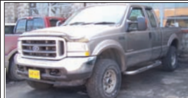
2004 FORD F250