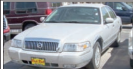
2008 MERCURY GRAND MARQUIS LS

Alloy Wheels, Power Windows, Locks, Sharp, #2090A