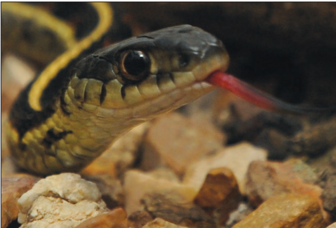
A garter snake smells using its tongue in his cage, Aug. 17. The garter snake is very common in the state of Missouri and is not poisonous or hostile.