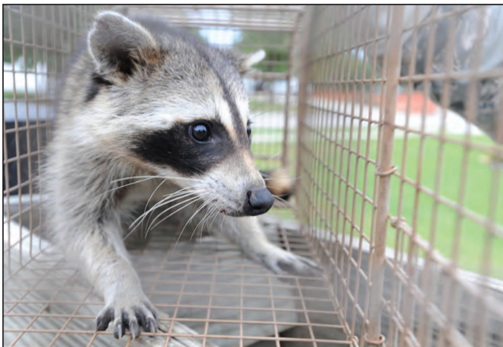
Left: A raccoon is caught in base housing by the 509th Civil Engineering Squadron Entomology shop, Aug. 17. Raccoons are legally and safely relocated after capture.