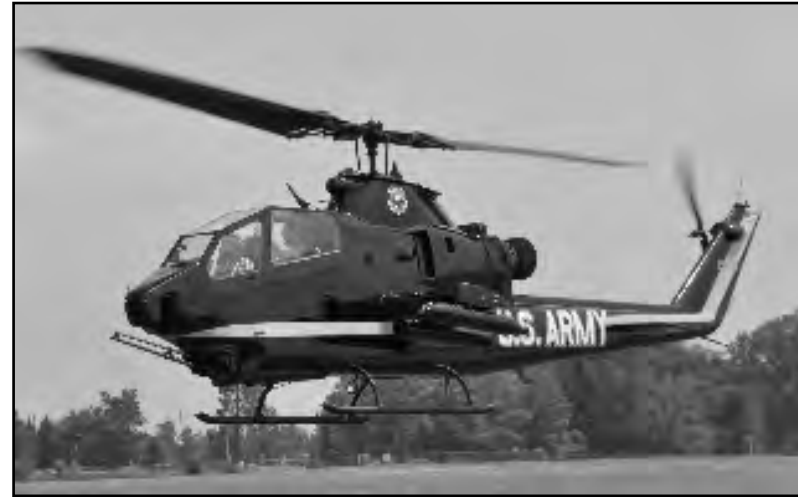
The Sky Soldiers, part of the Army Aviation Heritage Foundation, will perform a combat scenario called "Rescue at Dawn" with five aircraft from the Vietnam era at The Wings Over Whiteman Airshow Sept. 18 and 19.

The foundation has 37 aircraft, of which 17 are airworthy. Examples range from the 'beans, band-aids and