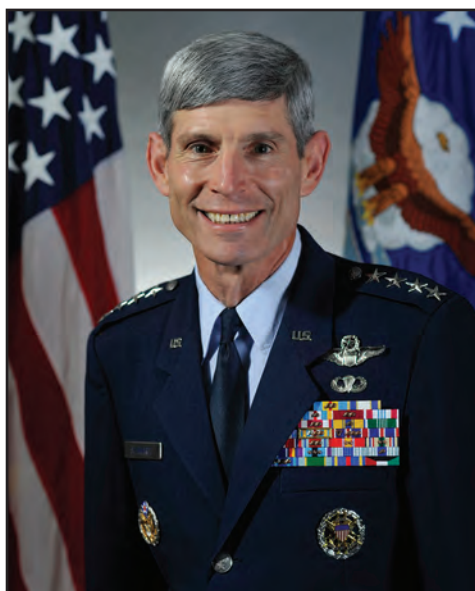
General Norton A. Schwartz Air Force Chief of staff

We made progress toward acquisition reform in the last two years, but we have