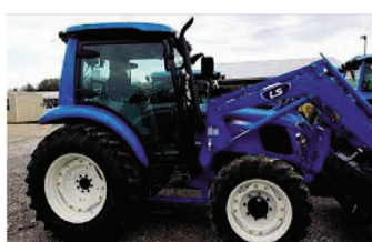
MT573 - 73 HP, 4WD, Q/A Loader And Skid Steer Bucket, Self Leveling, 3 Sets Of Remotes, Rear 3 Pt. Control, Extendable 3 Pt Arms, Cab w/Air, Heat & Radio, Shuttle Shift, $41,750