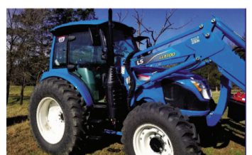
XP8084CPS - 84 HP, Cab w/Air, Heat & Radio, 4WD, Self Leveling Quick Attach Loader w/ Skid Steer Bucket, 3 Sets Of Remotes, Rear 3 Pt. Control, $49,750