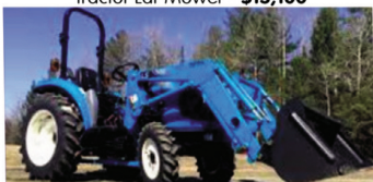
XG3025 - 25 HP, Shuttle Shift, 4WD, Q/A Loader & Skid Steer Bucket, - $14,650 XG3135 - 35 HP, 3 Cyl Diesel Engine, Q/A Loader With Skid Steer Bucket, 4WD, Shuttle Shift, $17,400 XG3140 - 40 HP, 3 Cyl Diesel Engine, Q/A Loader With Skid Steer Bucket, 4WD, Shuttle Shift, $18,500