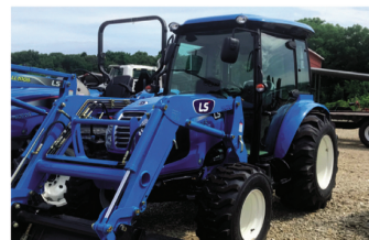
XR4140C - 40HP, 4WD, Shuttle Shift Transmission, Quick Attach Lader And Skid Steer Bucket, 2 Sets Of Remotes, Cab w/AC, Heat & Radio - $26,975