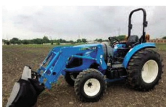
XR4140 - 40 HP, 4WD, Q/A Ldr w/Skid Steer Bucket, 2 Sets Of Remotes, Extendable 3 Pt Arms, Suspension Seat, Shuttle Shift, $22,900