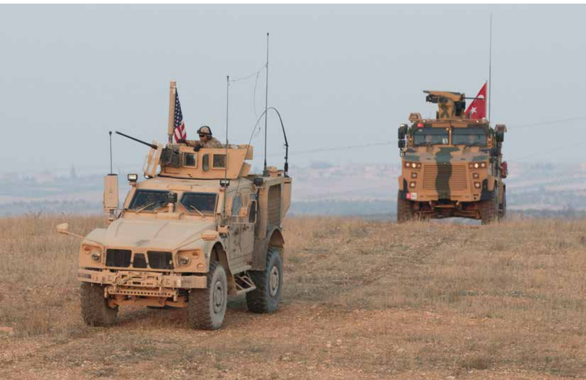
American and Turkish troops conduct a convoy during a joint patrol in Manbij, Syria, Nov. 8, 2018.