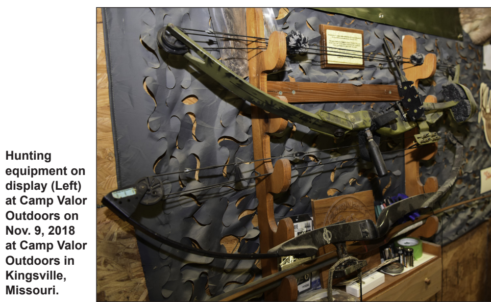
Hunting equipment on display (Left) at Camp Valor Outdoors on Nov. 9, 2018 at Camp Valor Outdoors in Kingsville, Missouri.