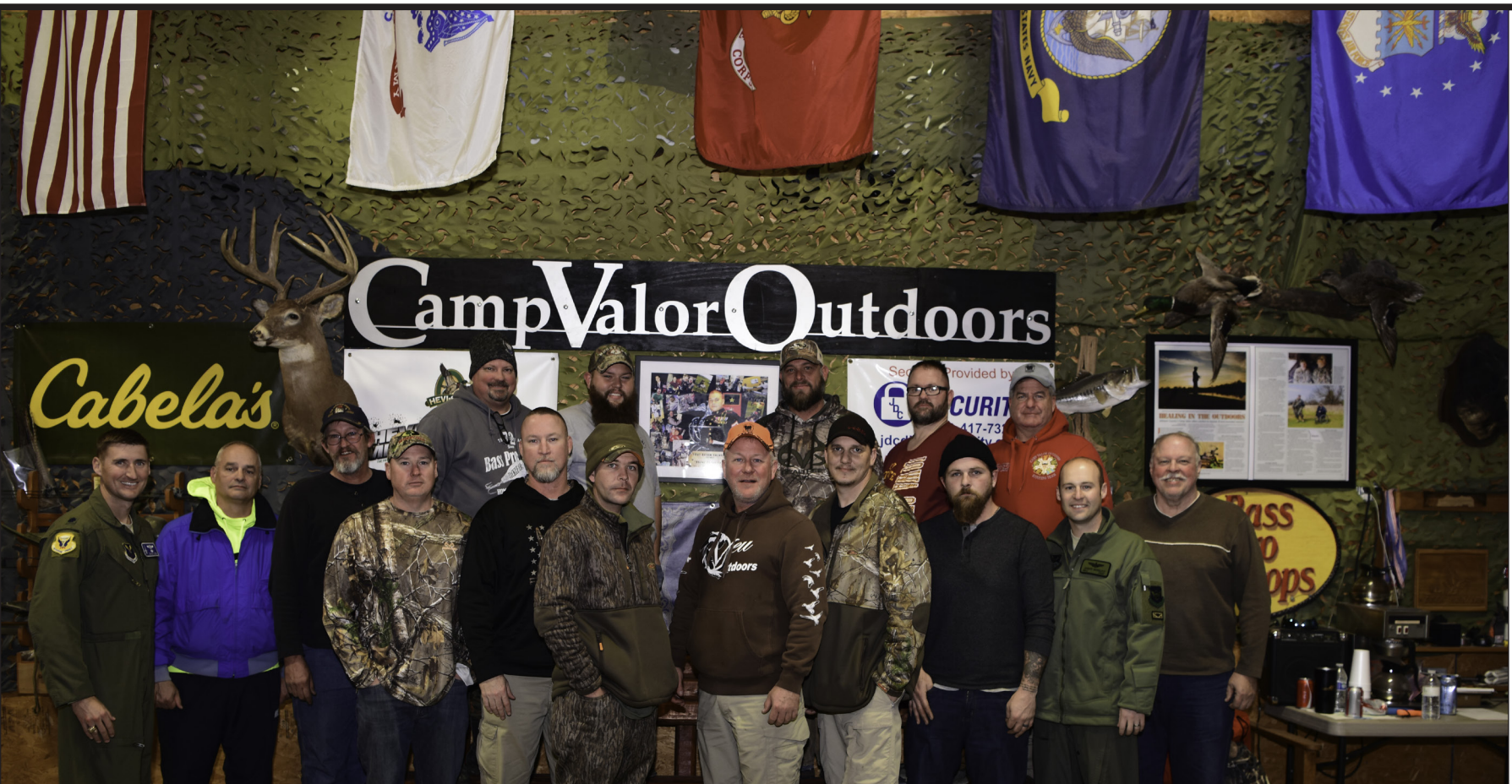
Participants in the Camp Valor Outdoors opening night hunting event pose for a group photo on Nov. 9, 2018 at Camp Valor Outdoors in Kingsville, Missouri. Camp Valor Outdoors is a nonprofit which works to connect veterans and their families to the outdoors.