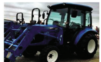
XR3135C - 35 HP, Cab With AC, Heat, Radio, 4WD, 2 Sets Of Hyd Remotes, Q/A Loader, Skid Steer Bucket, 540 PTO, 3 Pt Shuttle Shift $24,500