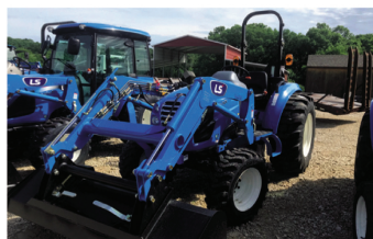
MT345E - 45 HP, 4WD, Quick Attach Loader And Skid Steer Bucket, Shuttle Shift, Foldable ROPS, 13 Gallon Fuel Tank w/ Loader - $21,150