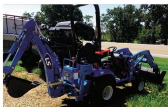
MT125 - 24.7 HP, 17.2 PTO HP Trans - 2 Range HST, 3 Pt Lift Cap, 970 Lbs, Ldr Lift Cap 886 Lbs Tractor & Loader - $13,200 Tractor, Ldr, Backhoe - $18,000 Tractor Ldr Mower - $15,100