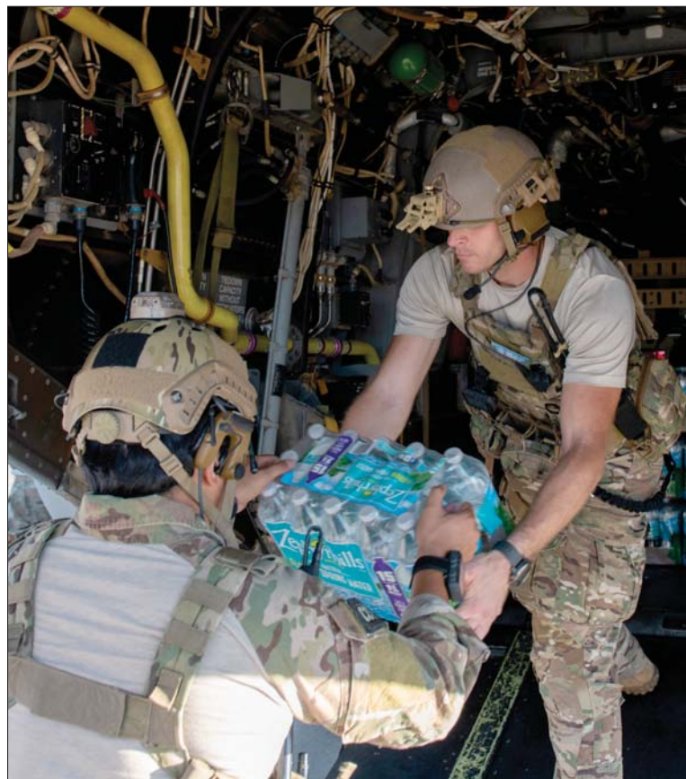
U.S. Air Force Special Tactics Airmen with the 23rd Special Tactics Squadron load water onto a CV-22 Osprey tiltrotor aircraft assigned to the 8th Special Operations Squadron at Hurlburt Field, Florida, Oct. 11, 2018.