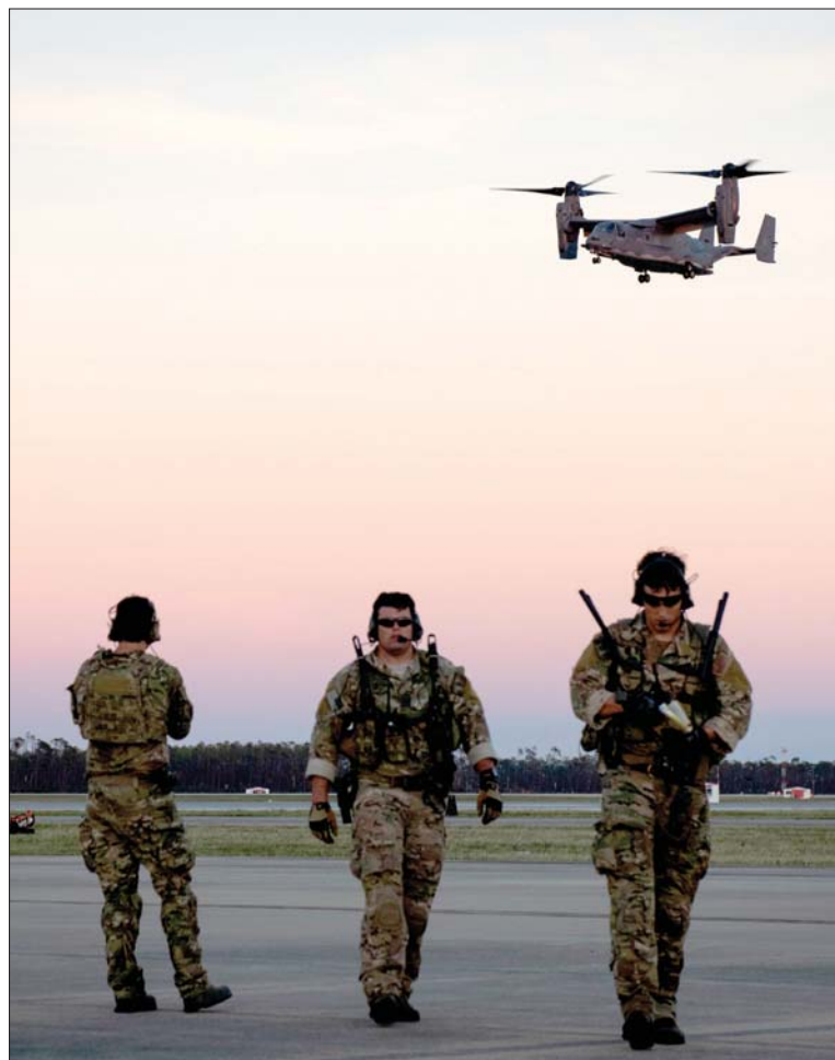
U.S. Air Force Special Tactics Airmen with the 23rd Special Tactics Squadron access Tyndall Air Force Base's airfield, Florida, Oct. 11, 2018. Special Tactics are prepared to assess, open and control major airfields to provide support during humanitarian operations.

LAKEVIEWVILLAGE.ORG 14001 W. 92nd Street • Lenexa, KS 66215