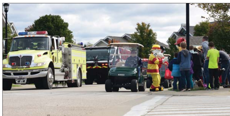
Members of the Whiteman Fire and Emergency Services Flight, along with community partners from Johnson County Fire Protection and the Knob Noster Fire Department, participate in an on-base parade on October 13, 2018, as part of Fire Prevention Week at Whiteman Air Force Base, Missouri. Smokey Bear and Sparky the Fire Dog gave candy to children and the Whiteman Fire Department hosted fire-prevention and fire-response activities in the Commissary parking lot following the parade.