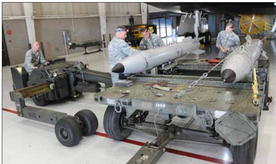
U.S. Air Force Airman 1st Class Juan De Santiago, a 393rd Aircraft Maintenance Unit weapons load crew member, picks up a B61-7 training munition using an MHU-83 D/E jammer during the Load Crew of the Quarter competition at Whiteman Air Force Base, Mo., July 15, 2016. The competition consisted of a uniform inspection, a composite toolkit inspection, a 25-question test about an Airman's knowledge of the munitions that will be loaded for the scenario, and evaluation of the team's ability to accurately perform the loading scenario while being timed.