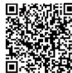
The Official Whiteman AFB Facebook Page