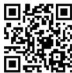
The Official Whiteman Website

Quick Response codes enable readers to access additional content outside the publication. Most QR code readers are available for free in the Android Market and App Store.