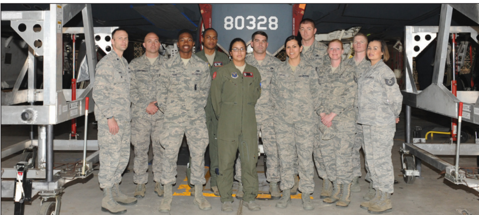
Members of the 90th Missile Wing (MW) at F.E. Warren Air Force Base (AFB), Wyo., pose for a group photo in front of a B-2 Spirit at Whiteman AFB, Mo., April 14, 2016. The 90th MW and the 509th and 131st Bomb Wings are participating in a "sister-base" partnership, officially named the Bomber Missile Exchange Course, which allows the organizations to learn from each other through scheduled visits.