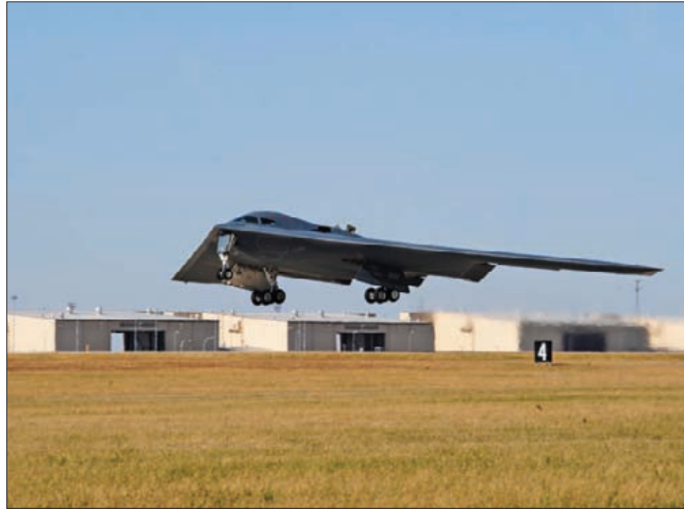
Three B-2 Spirits deployed from Whiteman Air Force Base, Missouri, to the U.S. Pacific Command area of operations March 8, 2016. The deployment will ensure bomber crews maintain a high state of readiness and proficiency, and will provide opportunities to integrate capabilities with key regional partners.