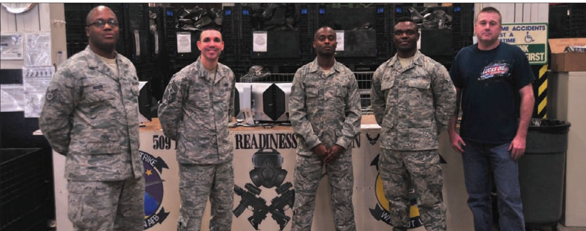
Members of the 509th Logistics Readiness Squadron (LRS) gather with Chief Master Sgt. Shawn Drinkard, the 509th Bomb Wing command chief, for a group photo at Whiteman Air Force Base, Mo., March 7, 2016. The Airmen of LRS were shadowed by Drinkard and explained the processes of the individual protective equipment section for pre-deployment out-processing.