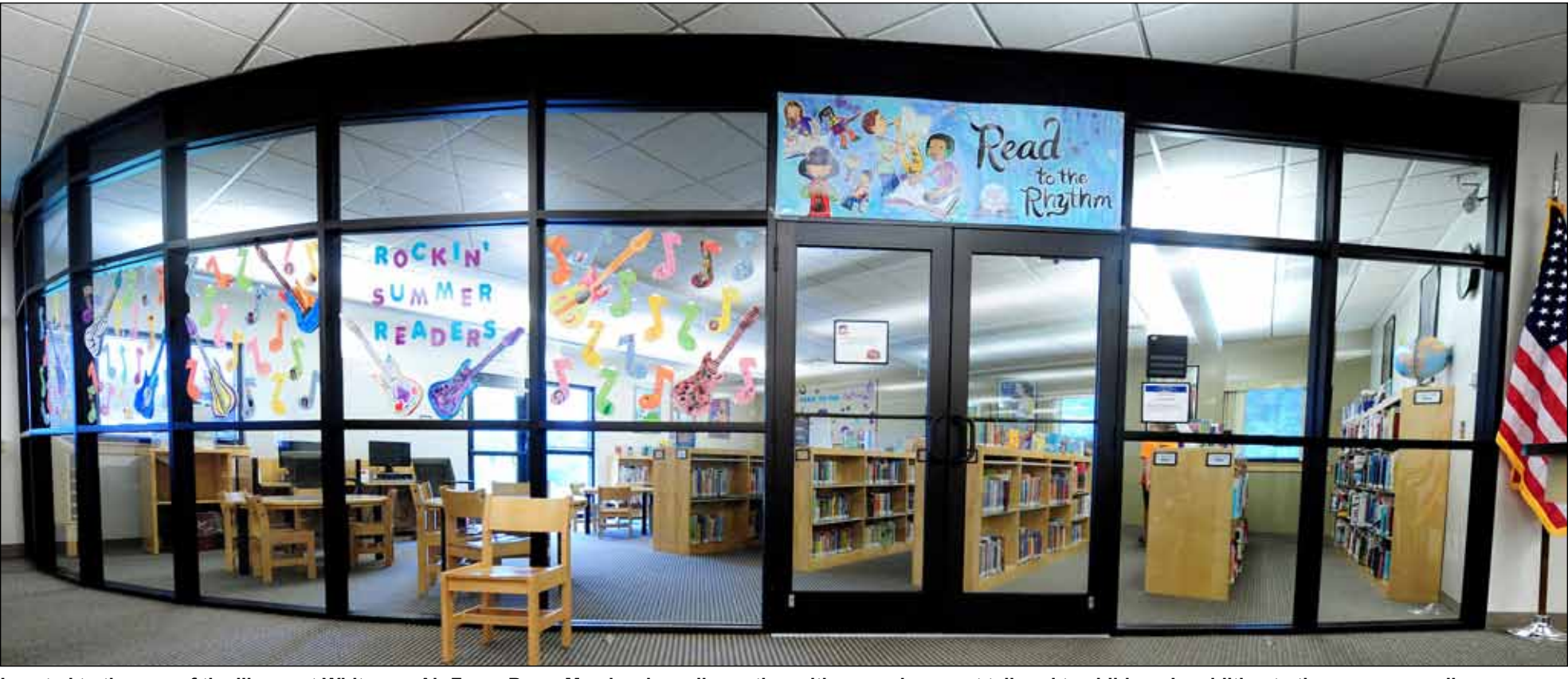
Located to the rear of the library at Whiteman Air Force Base, Mo., is a juvenile section with an environment tailored to children. In addition to the summer reading program, the library also hosts story time and craft time during the months of September through May for children ages 3 to 5.