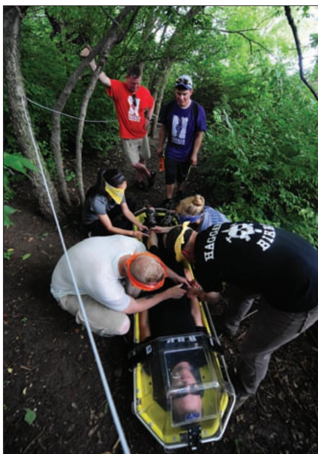
Members from Whiteman Air Force Base, Mo., participate in a "rescue-escape" challenge June 17, 2015, as part of the Tucker Leadership Lab in Liberty, Mo. During this challenge, Airmen used communication, trust and teamwork to carry an "injured" Wingman through an array of obstacles, guided only by a string and knowledge from those guiding the group.