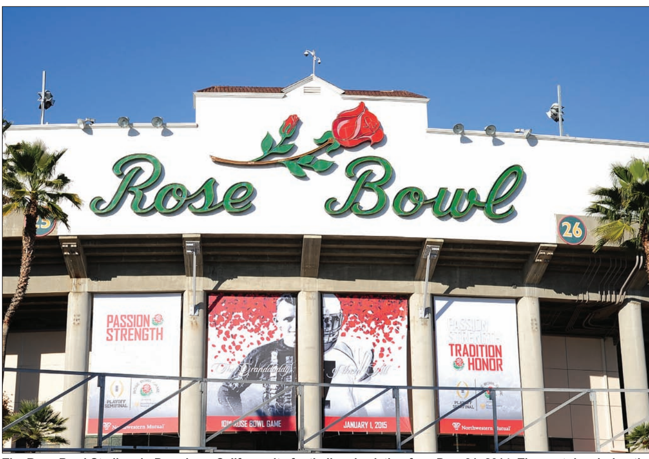
The Rose Bowl Stadium in Pasadena, Calif., awaits football and aviation fans Dec. 31, 2014. The next day during the 101st Rose Bowl Game, a B-2 Spirit stealth bomber from Whiteman Air Force Base, Mo., flew over the stadium, which was packed with more than 90,000 fans. The flyover was also watched on television by more than 28 million viewers.