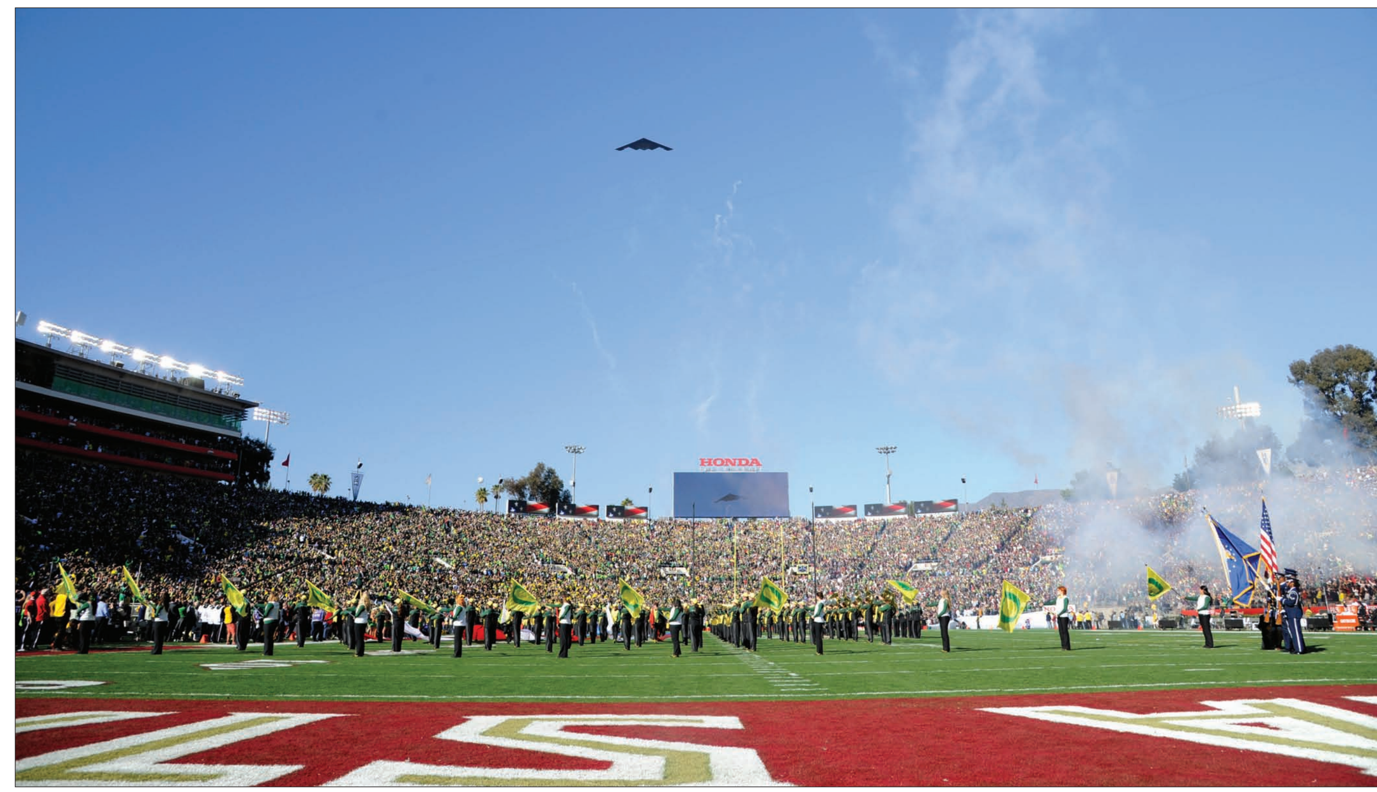
A B-2 Spirit stealth bomber from Whiteman Air Force Base, Mo., flies over the Rose Bowl Stadium during the 101st Rose Bowl Game Jan. 1, 2015, in Pasadena, Calif. The game was attended by more than 90,000 fans and viewed on televi sion by more than 28 million viewers.