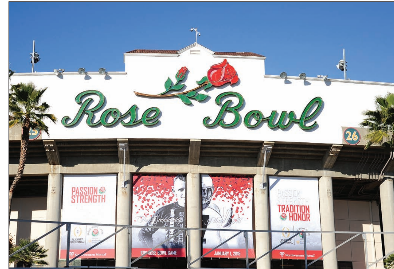
The Rose Bowl Stadium in Pasadena, Calif., awaits football and aviation fans Dec. 31, 2014. The next day during the 101st Rose Bowl Game, a B-2 Spirit stealth bomber from Whiteman Air Force Base, Mo., flew over the stadium, which was packed with more than 90,000 fans. The flyover was also watched on television by more than 28 million viewers.