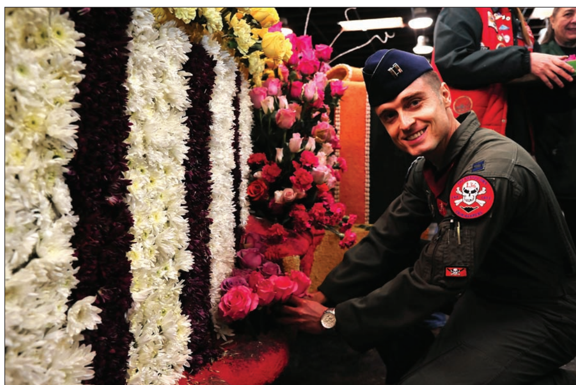
RIGHT: U.S. Air Force Capt. Christopher Conant, a 13th Bomb Squadron B-2 Spirit stealth bomber pilot from Whiteman Air Force Base, Mo., helps decorate a float Dec. 31, 2014, in Pasadena, Calif. The 126th annual Tournament of Roses Parade was attended by an estimated 750,000 people and viewed on television by 80 million viewers internationally.