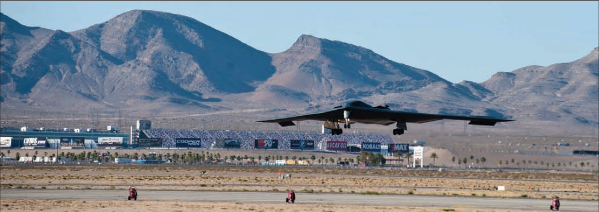
A U.S. Air Force B-2 Spirit assigned the 509th Bomb Wing lands June 23 at Nellis AFB, Nevada. The B-2 is a long-range stealth bomber capable of penetrating enemy defenses, can carry more than 40,000 pounds of both conventional and nuclear weapons, and fly approximately 6,000 nautical miles without refueling.