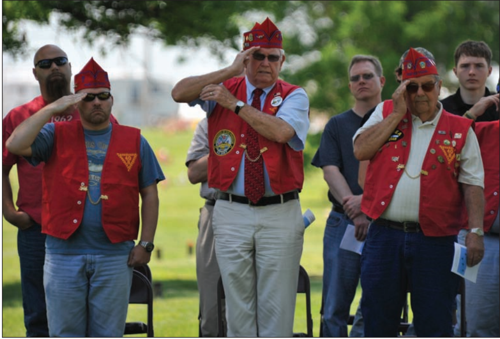
Members from the local Veterans of Foreign Wars chapter salute while the flag is raised during a wreath-laying ceremony for 2nd Lt. George Whiteman May 18, 2013, in Sedalia, Mo. Whiteman, a Sedalia native, was one of the first Airmen to die during World War II when the Japanese attacked Pearl Harbor.