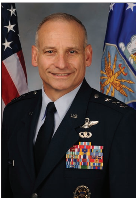
Lt. Gen. Jim Kowalski, commander of Air Force Global Strike Command

The Eighth Bomber Command, known today as 8th Air Force, led the strategic