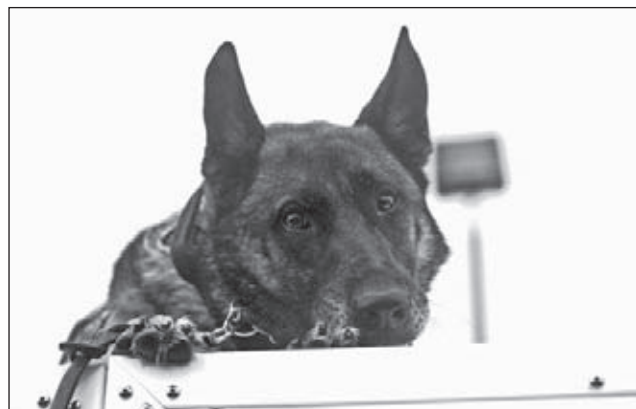
Mina, a 509th Security Forces Squadron military working dog, takes a break during a routine obedience course at Whiteman Air Force Base, March 23, 2013. The course helps trainers evaluate various abilities of the canines, such as speed, strength, agility, endurance and stamina.