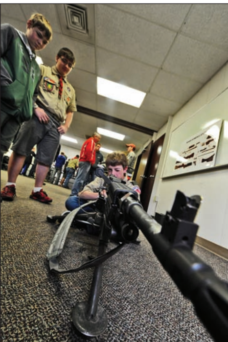
A Boy Scout from St. Louis, Mo., aims down the iron sights of an unloaded M240 Bravo machine gun during Scout Day at Whiteman Air Force Base, Mo., April 30, 2013. Scout Day gives children an opportunity to learn about the everyday Air Force mission.