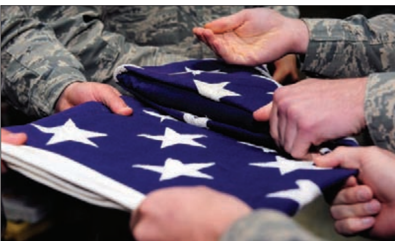
Members of the 509th Bomb Wing Honor Guard A-Team tightly fold a flag during training at Whiteman Air Force Base, Mo., April 23, 2013. Whiteman's Honor Guard is split into two teams, A-Team and B-Team, each consisting of 22 Airmen.