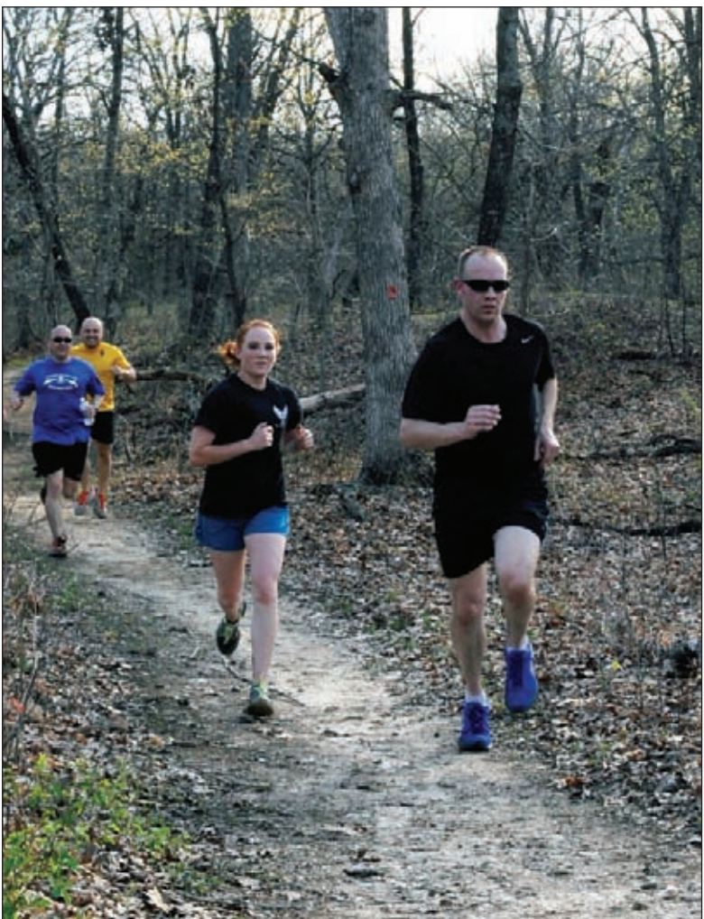
Members of Team Whiteman finishes a 10K run in Knob Noster State Park, April 28, 2013 in preparation of the Whiteman Striker Life Half Marathon. The Striker Life Half Marathon starts at 8 a.m., Saturday, May 11 at Ike Skelton Park. Airmen can pre-register by visiting the website, www.onestoprace.com .