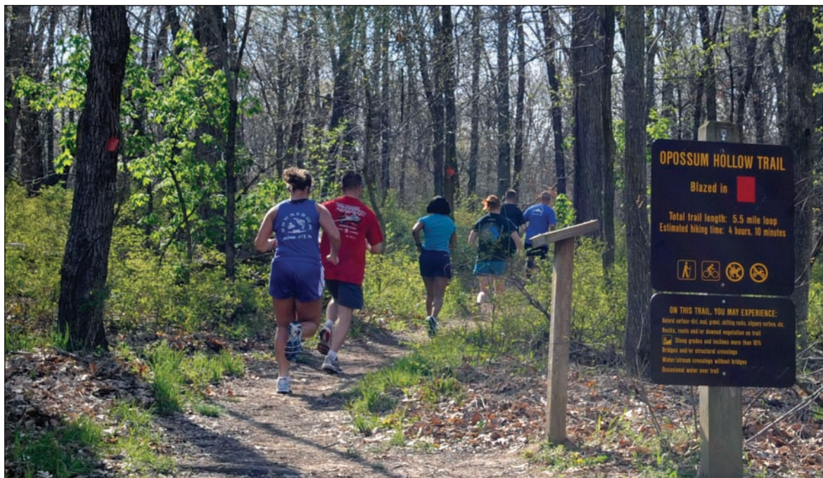
Members of Team Whiteman run a 10K in Knob Noster State Park, April 28, 2013 in preparation of the Whiteman Striker Life Half Marathon. A half marathon, 10K and a 5K run will be available for Airmen and their families to participate, May 11. Airmen can pre-register by visiting the website, www.onestoprace.com . All races begin at 8 a.m. at Ike Skelton Park.