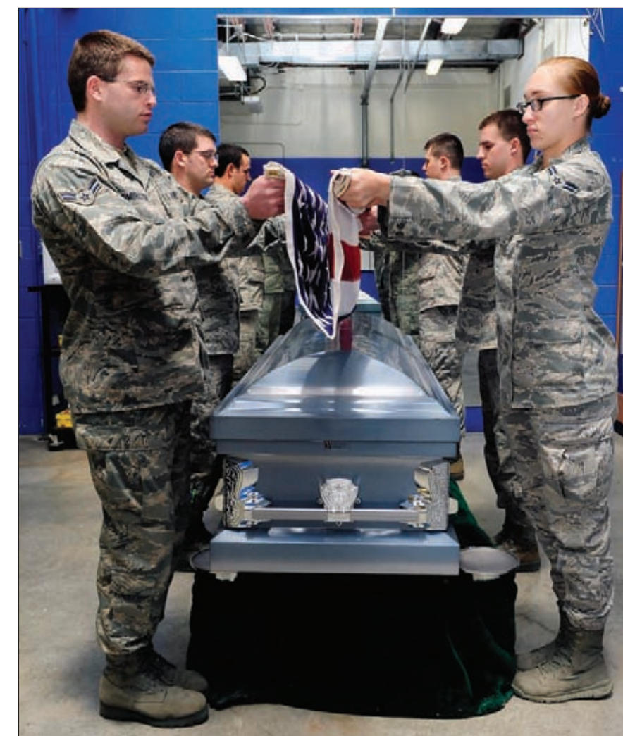
Members of the 509th Bomb Wing Honor Guard A-Team practice a seven-member flag fold for a funeral ceremony, Whiteman Air Force Base, Mo., April 23, 2013. The Honor Guard Airmen strive for perfection so they can leave a lasting impression on the family of the military member.