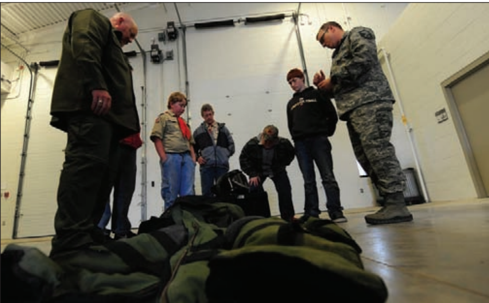
Boy Scouts from St. Louis, Mo., are briefed on explosive ordnance disposal during Scout Day at Whiteman Air Force Base, Mo., April 30, 2013. Cub Scouts from St. Louis, Warrensburg, Sedalia and Knob Noster have gathered at Whiteman Air Force Base annually to learn about the 509th Bomb Wing's mission and meet various organizations on base.