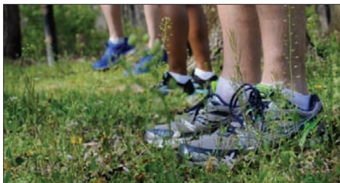
Members of Team Whiteman prepare to run a 10K in Knob Noster State Park, April 28, 2013 in preparation of the Whiteman Striker Life Half Marathon. The Striker Life Half Marathon starts at 8 a.m., Saturday, May 11 at Ike Skelton Park. A half marathon, 10K and a 5K run will be available for Airmen and their families to participate. Visit www.onestoprace.com to pre-register.