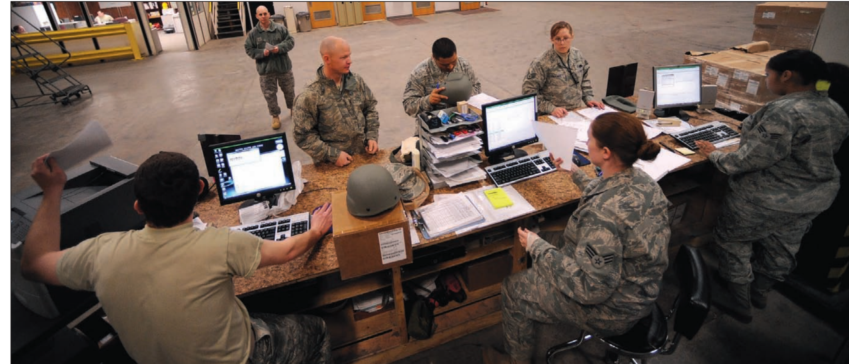
509th Logistic Readiness Squadron members issue deployment and exercise gear to Whiteman military personnel Feb. 28.