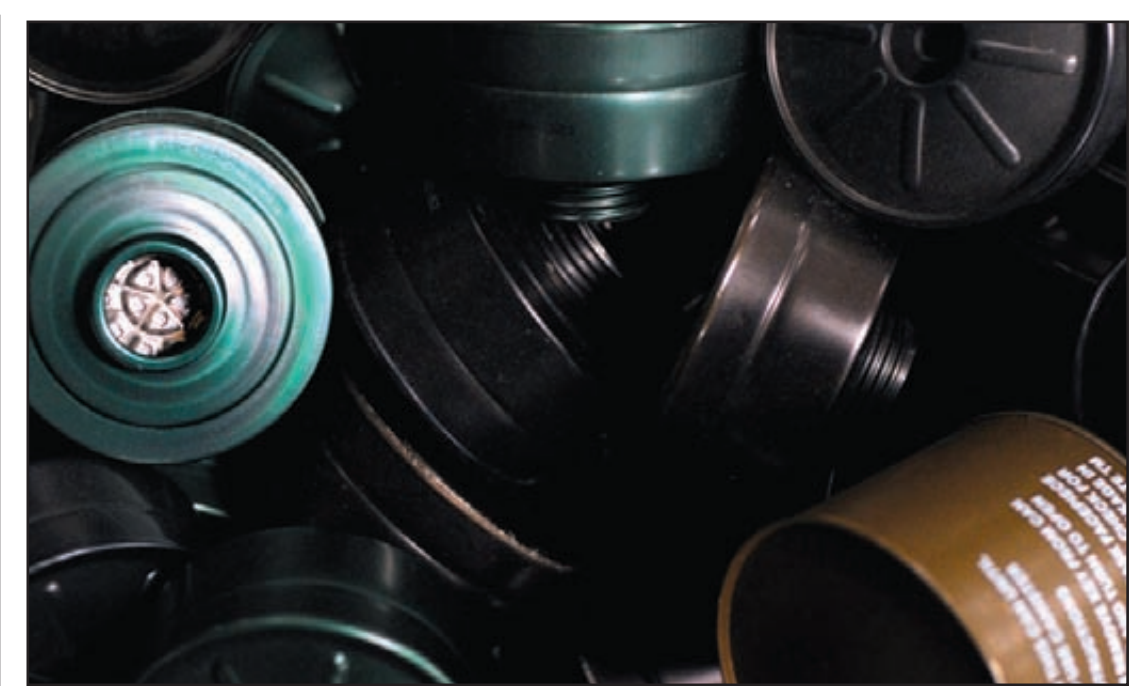
Top: Several canteens are shelved prior to issue. Center: Several training combat helmets are gathered and stored for issue. Bottom: Gas mask canisters are gathered and prepared for issue by the 509th Logistics Readiness Squadron Feb. 28.