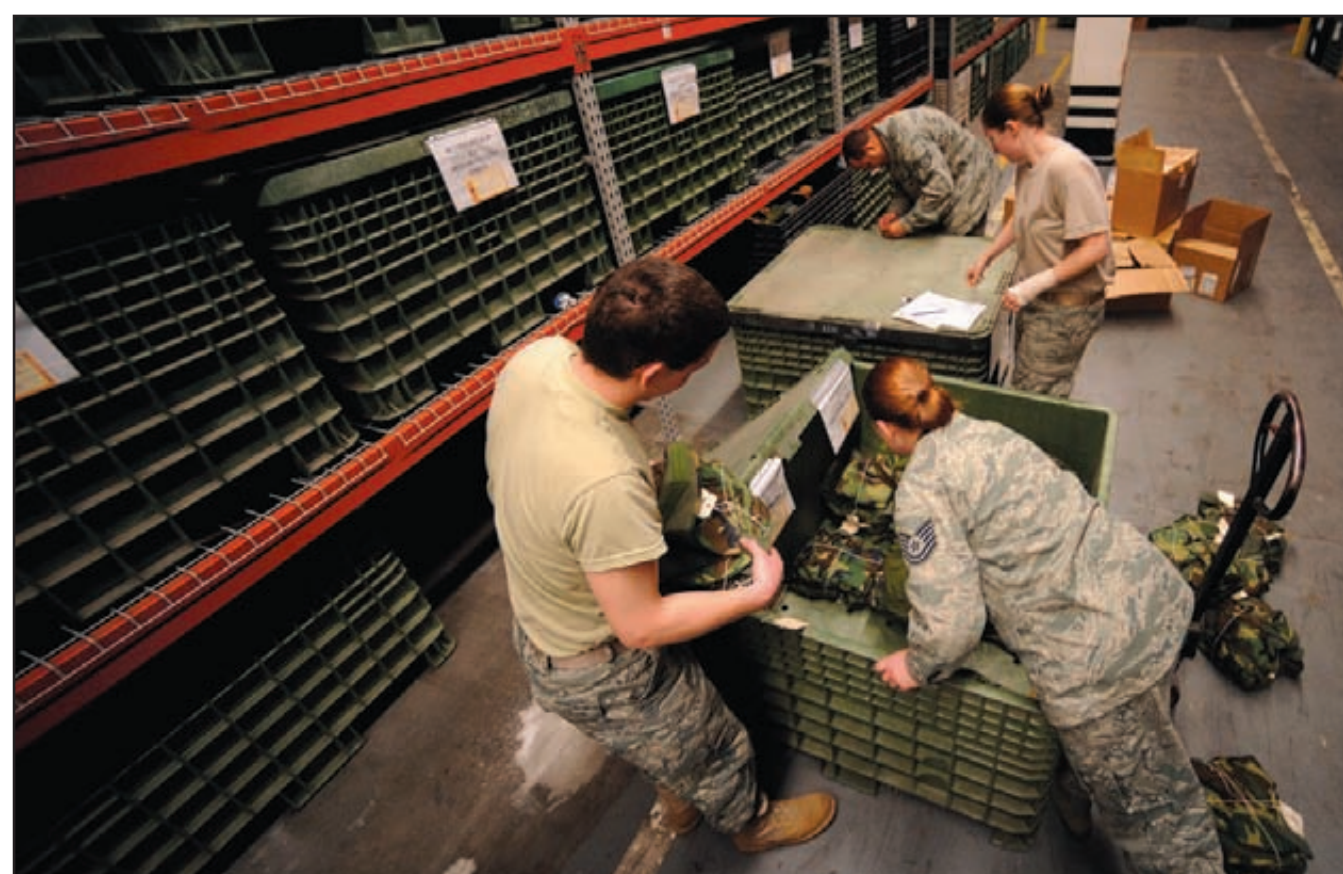
509th Logistic Readiness Squadron members pull out winter woodland pattern hoods, while taking inventory Feb. 28. Mobility members ensure Airmen at Whiteman are equipped with the proper gear needed for deployments and exercises.