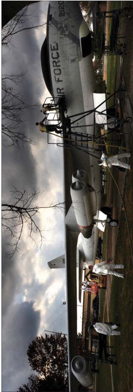
Airmen with the 131st and 509th Maintenance Squadrons prepare a B-47 Stratojet static display for a paint job, Nov. 11. The 131st and 509th maintenance Airmen will continue prepping the B-47 over the next few weeks before performing a complete paint job.