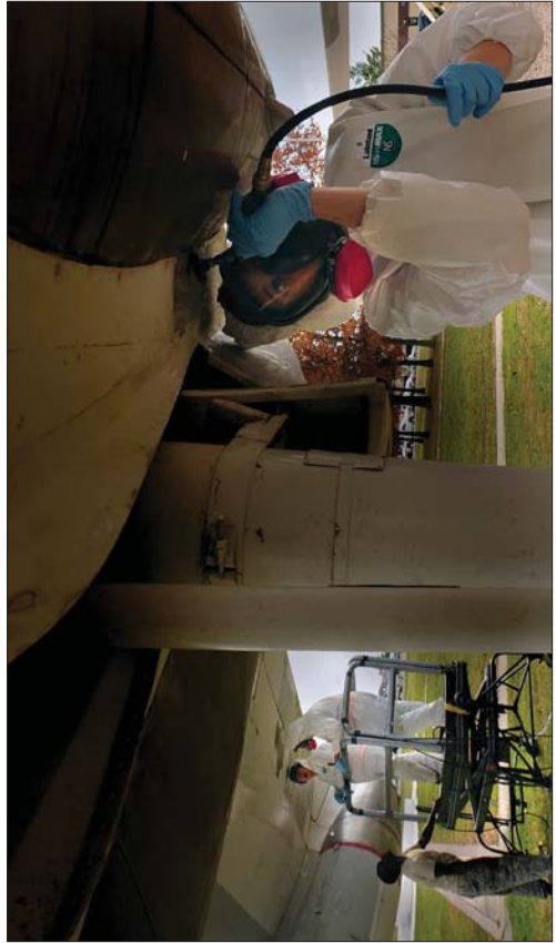
An Airman with the 509th Maintenance Squadron grinds down a section of a B-47 Stratojet wing as a part of the pre paint job process, Nov. 11. The B-47 was a major innovation in post-World War II combat jet design and helped lead to modern jet airliners such as the B-2. The Stratojet now serves as a static display at Whiteman AFB.