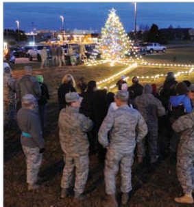
Members of Team Whiteman gather around the Holiday Tree outside of the Mission's End, Nov. 30.