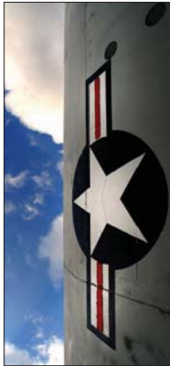
A tattered aviation symbol is displayed on the side of an old B-47 Stratojet prior to being sanded down for a new paint job, Nov. 11. The B-47 arose from an informal 1943 requirement for a jet-powered reconnaissance bomber, drawn up by the U.S. Army Air Forces to prompt manufacturers to start research into jet bombers.