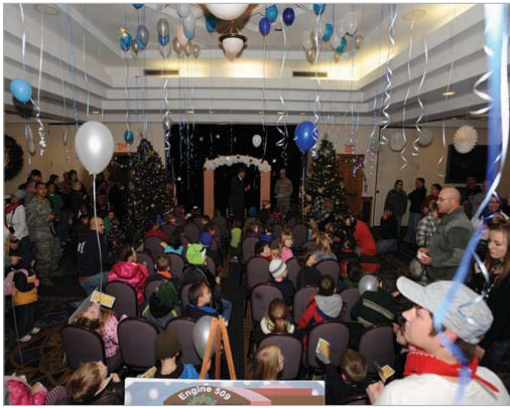
Team Whiteman families enjoy the Holiday Tree Lighting and Open House with holiday music and laughter, Nov. 30. Whiteman held an Open House following the tree lighting with cookies, crafts and a book reading.