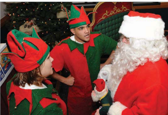
Santa Claus and his elves prepare to greet the children attending the Whiteman Holiday Tree Lighting and Open House, Nov. 30.