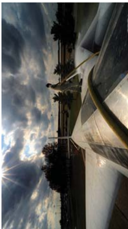
An Airman with the 509th Maintenance Squadron sprays down the top of a B-47 Stratojet static display after sanding it in preparation for a paint job, Nov. 11. The B-47 never saw combat as a bomber, but was a mainstay of Strategic Air Command deterrence mission during the 1950s and early 1960s. It remained in use as a bomber until 1965.