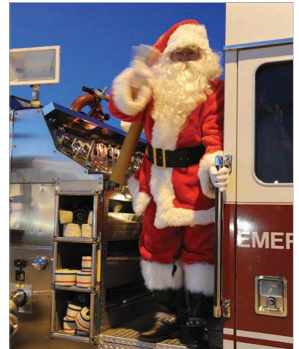
Santa Claus arrives at the Holiday Tree Lighting and Open House ceremony with help from the Whiteman Fire Department, Nov. 30.