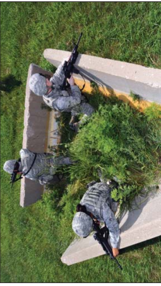
Airmen from the 509th Security Forces Squadron monitor a 360° view during a Nuclear Surety inspection, Jul. 17. The 509th SFS Airmen responded to multiple security simulations designed to test response times and procedures.