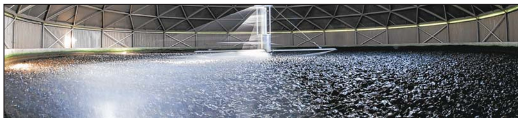
The clarity filter allows sludge to settle to the bottom of the tank while the clear water trickles out the sides and on to the next process.

Airman First Class Barry Hochderffer, 509th Civil Engineer Squadron, draws a sample downstream from the treatment plant, July 22. This sample is the most crucial in the whole treatment process, measuring Whiteman's footprint on the local environment.