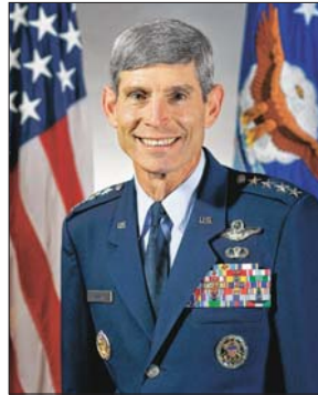
Gen. Norton A. Schwartz Air Force Chief of Staff