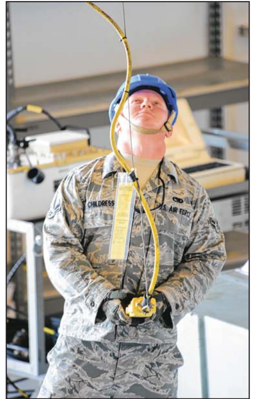
This Week's Photo